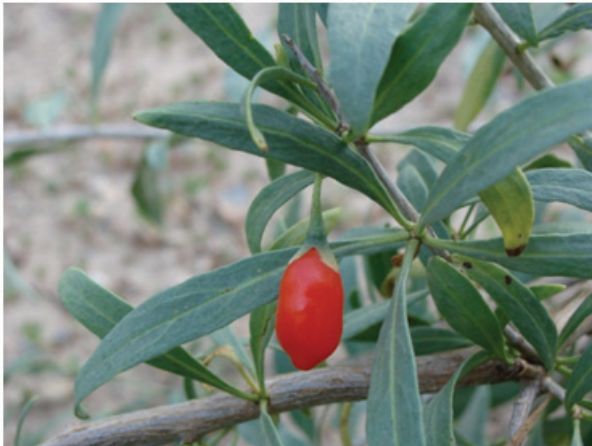
Figure 2. The leaves of a V_2 LB individual

The plants in the experimental field showed similar biological characteristics as in scientific literature. However, there were some shape differences between V_1 and V_2 plants' leaves. Also, V_2 's leaves were a paler shade of green than those on V_1 's plants (Figure 2).