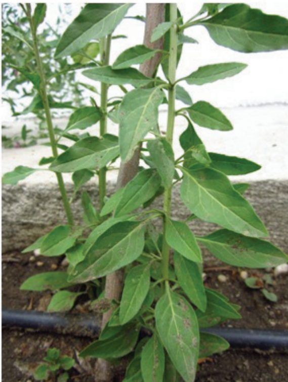
Figure 3. The leaves of a V_1 LB individual

The V_1 leaves were broader, usually ovate or elliptical (Figure 3). The V_2 leaves were mostly lanceolate. It can also be noted that V_1 plants manifested variability for the shape of their