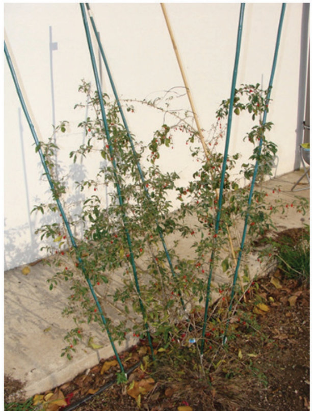
Figure 1. LB V_1 shrub which has been tutored

Because of the goji's decumbent nature, in the second year from planting, the shrubs have been assisted in their growth using tutors (bamboo canes). This has been done taking into account the plants' natural growth tendencies (Figure 1).