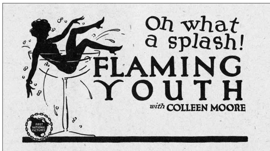
▲ Fig. 2. The shooting script for Flaming Youth indicated that its party scenes should not show actual drunkenness but “youth and vitality capable of absorbing a lot and showing it only in flushed faces and half-closed eyes.” Pressbook image from the collections of the Wisconsin Center for Film and Theater Research.

In the novel, Pat also confesses that she is not a virgin to her fiancé Monty. In a parallel scene in the shooting script, in which Pat asks Monty about his past, the implication of Pat and Cary’s affair, though present, is more oblique, and requires lip reading on the part of the audience to fill in all the blanks. Monty admits that there has “been someone else” and Pat states that there has been for her, too. The shooting script indicates that Monty replies to her, but without a dialog title, “You don’t mean—My God, Pat!” and that Pat nods her head. At his outraged reaction, her subsequent dialog title states, “Do you mean to tell me that what’s all right for you is all wrong for me—that you expect me to forgive you when you wouldn’t forgive me?” 38 Relying on lip-reading for a bit of Monty’s most telling dialog is a fairly thin disguise for what has passed between the two. Unlike the novel, however, the scene does leave the question of what exactly it means that there has “been someone else” up to the imagination of the viewer, even if not much imagination is required.