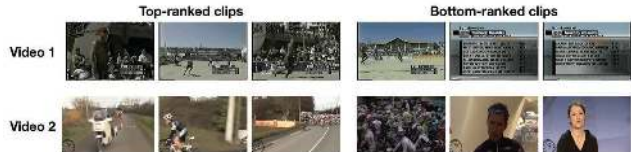
Figure 3: Top-ranked and bottom-ranked clips by SCSampler for two test videos from Sports1M. Top-ranked clips often show the sports in action, while bottom-ranked clips tend to be TV-interviews or static segments with scoreboard. Clips are shown as thumbnails. To see the videos please visit http://scsampler.ai .

While our SCSampler has low computational cost, it adds the procedural overhead of having to train a specialized clip selector for each classifier and each dataset. Here we evaluate the possibility of reusing a sampler s(\cdot) that was optimized for a classifier f on a dataset \mathcal{D} , for a new classifier f' on a dataset \mathcal{D}' that contains action classes different from those seen in \mathcal{D} . In Table 3, we present cross-dataset performance of an SCSampler trained on Kinetics but then used to select clips on Sports1M (and vice-versa). We also report cross-classifier performance obtained by optimizing SCSampler with pseudo-ground truth labels (see section 3.2.2) generated by R(2+1)D-18 but then used for video-level prediction with action classifier MC3-18. On the Kinetics validation set, using an SCSampler that was trained using the same action classifier (MC3) but a different dataset (Sports1M) causes a drop of about 2% (65.0% vs 67.0%) while training using a different action classifier (R(2+1)D) to generate pseudo-ground truth labels on the the same dataset (Kinetics) causes a degradation of 1.1% (65.9% vs 67.0%). The evaluation on Sports1M shows