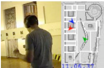
Figure 2. The 'boomerang' example

G: There is a big thing along, it looks like a boomerang shape, that's a big wall with glass with pictures on it. R: Where is the big wall? G: I am walking along that, is on my left hand side as I move up *1* R: Yes on your left side. It's got a boomerang [shape]? G: [Boomerang] shape, a-ha