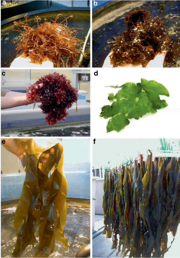
Fig. 22.2 Examples of macroalgae grown in aquaculture. (a) Solieria , a carrageenophyte; (b) Chondrus crispus “Irish Moss” carrageenophyte; (c) Palmaria palmata , used as feed for abalone; (d) Ulva lactuca , used for bioremediation (uptake of excess nutrients) and feed; (e, f) Saccharina latissima , after 9 months in tank culture and (f) phylloids drying for storage demonstrating how evenly they are grown.

Next in the ranking according to production volume are countries mostly from Africa (e.g., Tanzania, Madagascar, South Africa, and Namibia) with 108,400 t in 2009 and Western Europe (e.g., Spain, France, Italy, and the Russian Federation), which are responsible for the remaining biomass production volumes. Finally, the Pacific Ocean Islands grow just a small amount of seaweed and produced 2,377 tons in 2009 (Fiji, Kiribati, and Solomon Islands) (FAO 2011a, 2010b).