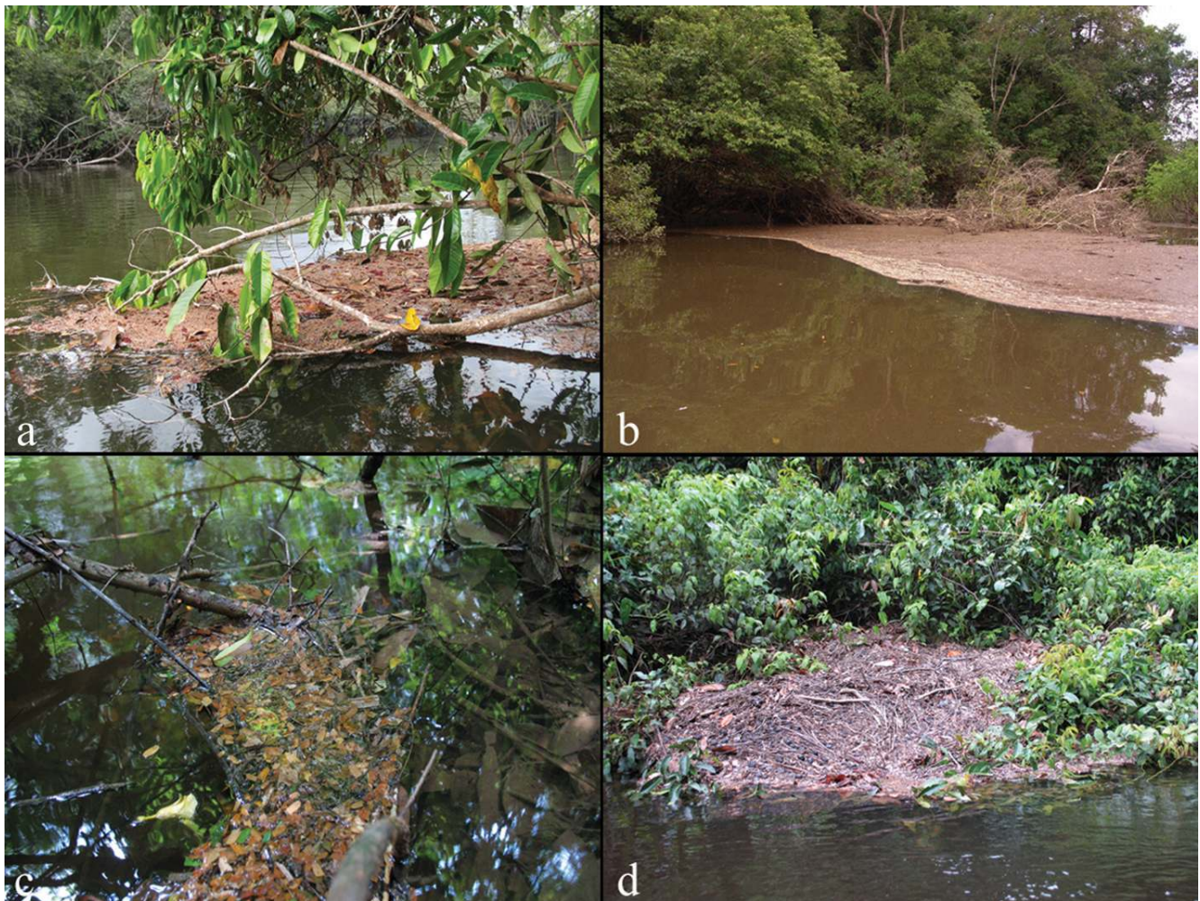
Fig. 1. Floating litter banks of different dimensions and means of accumulation ( i.e. , diverse retention mechanisms): (a) floating litter banks retained by branches of riparian vegetation; (b) a large floating litter bank retained in a “ria lake” condition at the confluence of the Aliança Stream with the Branco River; (c) a small floating litter bank close to the margin of a 4 th -order stream in the Urubu River basin; and (d) a large floating litter bank almost completely out of the water in a stream in the Urubu River basin during the dry season.

Despite their putative temporal instability, such habitats are colonized by a variety of benthic, pelagic and nektonic organisms and were given the name “kinon” by Fittkau (1977). This author described the fauna of a kinon to be mostly aquatic macroinvertebrates and fungi and