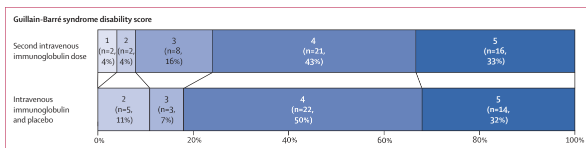
Figure 2: Guillain-Barré syndrome disability score at 4 weeks in the modified intention-to-treat population