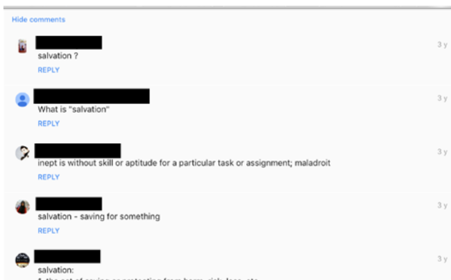
Fig. 2. Participants' interaction on Google+ (CO)

Classroom observation (CO) is used to triangulate the data for this section. Figure 2 shows a print screen from the participant interaction during Google+ classroom activities. Participants made full use of the Internet to look for meanings and definition of terms when asked by the teacher. The other participants benefitted from this activity by asking questions and providing their own version of the answer. It was observed that the roles of the teacher are as a facilitator - initiate, probe and also guide the participants to find the suitable answers. Based on the observation notes made by the researcher, this section of the interaction indicates that participants provide the meaning of new words they discovered with the help of Google search. Instead of the teacher providing the meaning and translation, participants helped each other in understanding of terms. The evidence indicates that the participants are independent students.