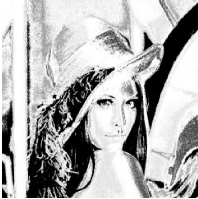
Fig. 4. The watermarked image of Lena after being attacked using “StirMark”

important. There is a good case for arguing that the template is somewhat more robust than the watermark. The reason for this is, that the template actually has to carry less information than the watermark. For example, suppose it is only possible to recover the watermark if the rotation angle and scaling factor recovered using the template are both 99.9% accurate. To give 99.9% accuracy one needs \log_2(1000) \approx 9 bit. Specifying both the angle and the scaling factor therefore needs around 18 bit which is considerably less than the amount of information contained in a typical watermark (about 128 bit).