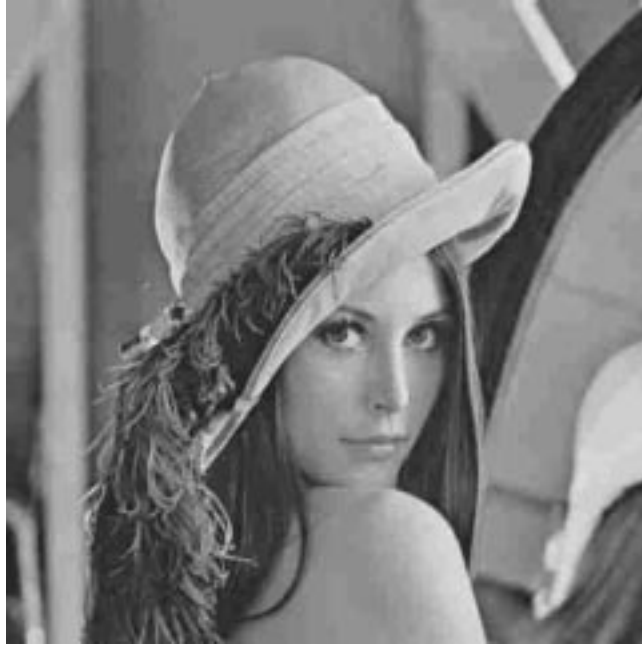
Fig. 3. A watermarked image of Lena compressed at 15% quality factor. The compression ratio is 100:1

Robustness to other attacks: Specialised watermark removal algorithms have been proposed in the literature. StirMark [Kuhn97] uses both contrast based attacks and geometric attacks. The geometric attacks are not directly addressed using the method proposed in this paper. However, we can give one good example of the robustness of the spread spectrum watermark described in this paper to a contrast based attack. The results are as follows: