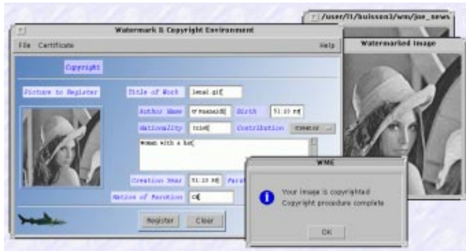
Fig. 5. The watermarked image of Lena being registered for copyright protection using a Java console

actually investigating new spread spectrum techniques for the watermarking of audio and binary data.