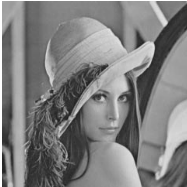
Fig. 2. A watermarked image of Lena

Figure 2 shows an image that was quite strongly watermarked using the techniques described in this paper. Figure 3 shows this image after JPEG compression was applied at 15% quality factor where it is found that that the storage required is less than 1% of that needed for the original image. Not surprisingly, the quality is very low and the image is of little commercial use. A 104 bit watermark “The watermark” (in ASCII code) can be recovered from the JPEG compressed image.