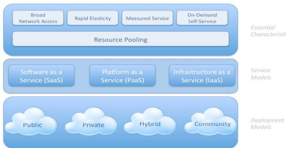
Fig. 1 NIST visual model of cloud computing definition [3].

Cloud computing is a model for enabling on-demand network access in order to share computing resources such as network bandwidth, storage, applications, etc , that is able to be rapidly scalable with minimal service provider management [2]. National Institute of Standard and Technology (NIST) describes cloud computing with five characteristics, three service models and four deployment models.