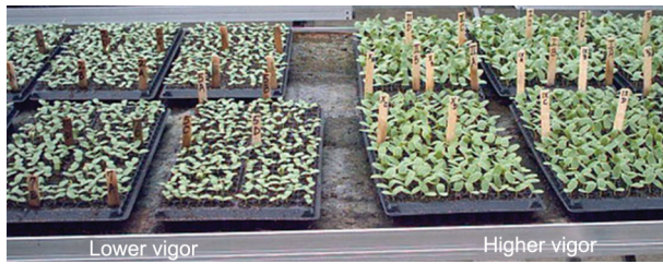
Figure 2 – Melon seedling emergence from two seedlots with differences in vigor when exposed to thermal stress after sowing. (Marcos-Filho et al., 2006). Just after sowing seeds were exposed to 18 °C for three days and then kept at 25 °C for subsequent germination. Seedlings from lower vigor seeds were adversely affected by suboptimal temperature in contrast with those of higher vigor.

seedling emergence or greater storability. Seed vigor can be considered an abstract characteristic and this expression was probably introduced to “fill a slot” owing to the absence of effective parameters to elucidate frequent questions about seed performance under less favorable conditions.