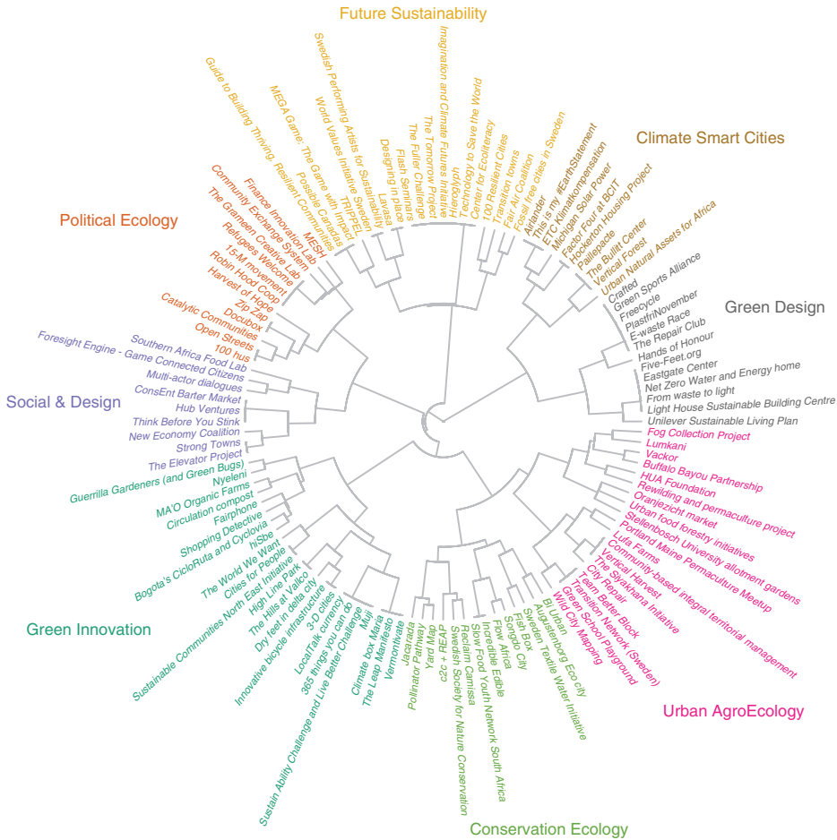
Figure 16.3 Urban seeds clustered into groups based on hierarchical clustering of the Anthropocene challenge(s) they address and their social-ecological type.