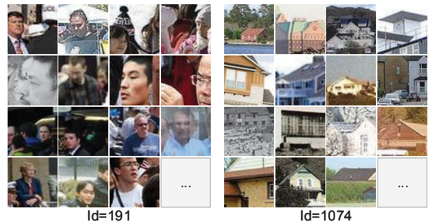
Figure 3: Visualization of VD. The left and right indices reflect the semantic of “head” and “building” with consistent visual patterns, respectively.

BUTD-based methods mainly include three inference stages: CNN forwarding, region feature generation, and Transformer forwarding [2]. In contrast, SOHO only includes two inference stages of CNN and Transformer forwarding. To compare the inference efficiency of SOHO and BUTD-based methods, we set up an experiment on a V100 GPU with 600 \times 1000 input resolution, a ResNet-101 backbone, a 12-layer Transformer, 100 boxes, 16 sentence padding length. The average inference time for extracting BUTD features on ResNet-101 is 21ms. The input sequence length of the Transformer for BUTD-based methods and SOHO are 100 + 16 = 116 and \lceil 600/64 \rceil * \lceil 1000/64 \rceil + 16 = 176 , respectively. Thus the inference time of Transformer is 17ms and 23ms for BUTD-based methods and SOHO, respectively. For BUTD-based methods, in addition to a 420ms time cost of region feature generation, the main time cost, however, comes from the non-maximum suppression which is required to be applied to all 1,600 categories. Consequently, the 44ms time cost of SOHO for an inference step is about 10 times faster than the 464ms time cost