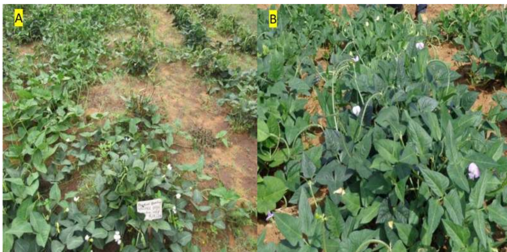
FIGURE 3 | Variation in flower color (A) white flower color, (B) purple flower and field plant stands of M 5 Nakare mutants observed at Omahenene Research Station in Namibia.

31 cm (Table 5). Bira mutants induced with 300 Gy produced longer pod size (30 cm) (Table 6). Relatively heavier pod size (4003 g/plant) was recorded for Bira at 300 Gy (Table 4). At the M 4 , Bira had pod size measured at 325 g/plant at 300 Gy. Notably