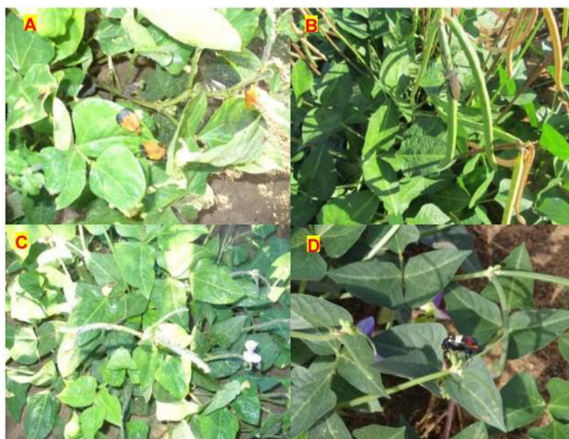
FIGURE 6 | Common insect pests (A) Spiny brown bugs Clavigralla sp., (B) Coreid bug Anoplocnemis curvipes , (C) Aphids Aphis craccivora Koch and Blister (D) Beetle Mylabris phalerata observed among the M 5 mutants at Bagani, and Omahenene Research Stations concurrently.

The present study demonstrated that most characters of cowpea which are of interest to plant breeders can be altered through mutations using the gamma irradiation technique. Furthermore, new plant attributes were created in the high yielding and well adapted local cowpea varieties. Various pests were observed on mutant cowpea during this study Figure 6. Therefore, there is a need to breed for insect pest tolerance in cowpea. Timko et al. (2007) suggested that the future of cowpea improvement programs should focus on breeding