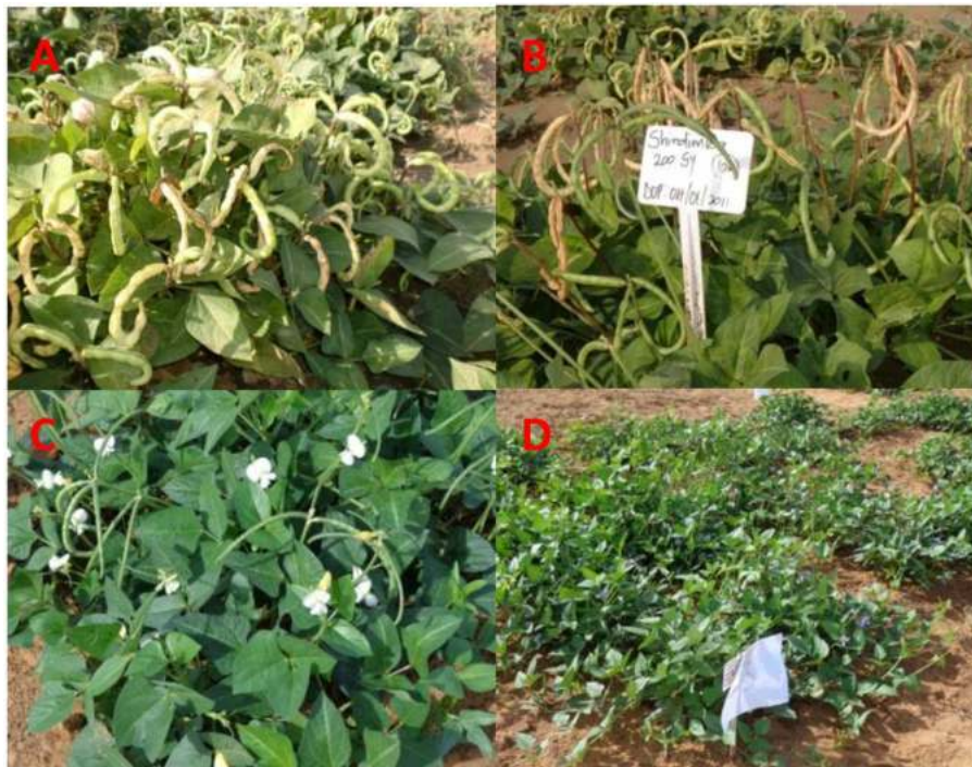
FIGURE 5 | Variation among Shindimba mutant lines. (A) coiled pods, (B) semi-coiled pods observed at Mannheim during the M 2 generation, (C) white flower with semi-coiled pods, and (D) Purple flowers observed at Omahene during the M 5 generation.

FC, flower color, where 1 = white, 2 = purple; PS, pod shape, where 1 = straight, 2 = coiled or curved; PC, pod color, where 1 = cream; SC = seed color, where 1 = white, 2 = brown, 3 = red, 4 = cream, 5 = speckled, 6 = chocolate, 7 = light brown, 8 = black, 9 = mixed, 10 = dark brown; SCT, seed coat texture, where 1 = smooth and 2 = rough; GH, growth habit, where 1 = bushy, 2 = erect and 3 = spreading; PI, pest infestation, where 0 = none, 1 = mild, and 2 = severe.