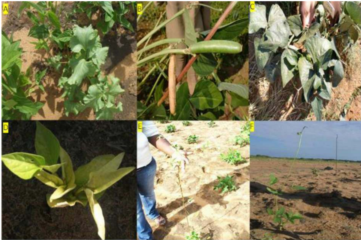
FIGURE 2 | Some common abnormalities at M 3 observed at Bagani Research Station. (A) spinach-like leaves, (B) Short-pods, (C) broad-dark leaves, (D) chlorophyll mutant, -single stem (E,F) observed at Omahenene research Station.