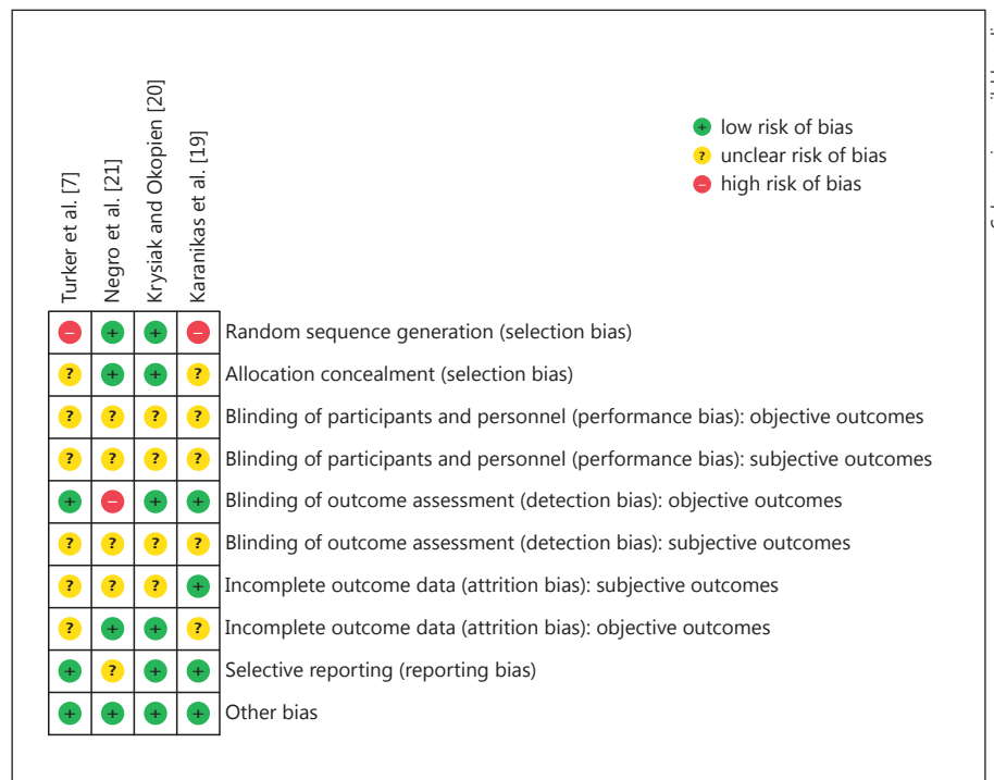
Fig. 2. Risk of bias summary: review of the authors' judgments about each risk of bias item for each included study.

LT 4 = Levothyroxine; FT 4 = free thyroxine; TSH = thyroid-stimulating hormone; TPOAb = thyroid peroxidase antibodies; TgAb = thyroglobulin antibodies; FT 3 = free triiodothyronine.