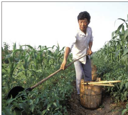
Toxic pesticides are readily accessible in farming households of the developing world

Some experts believe that a distinction exists, particularly in terms of intent, between people who harm themselves (attempt suicide) and those who die (commit suicide). 6 WHO's report on violence and health, however, acknowledges that, although an intent to die is a key element of suicide, determining the level of intent for an individual is difficult. 2