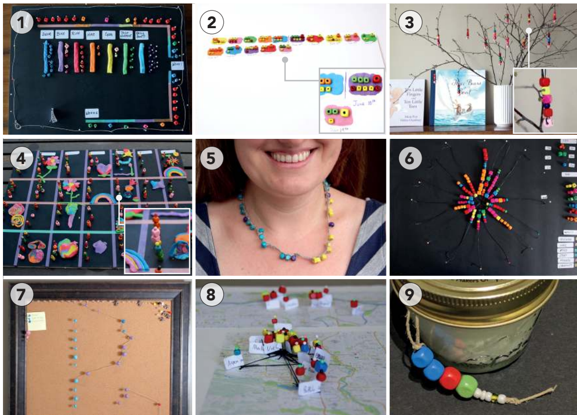
Figure 1. Overview of all 9 participants' projects. The topics are: (1) workouts, (2) hip pain, (3) mood, (4) nutrition and bowel movements, (5) distractions during writing, (6) enjoyment of activities, (7) meditation, (8) places visited in a new city, (9) recipes for homemade care products.

[P5] Distractions during Writing: P5 created wearable physicalizations of distractions during her thesis writing. She anticipated that wearing them would motivate her to be focused. She made one bracelet/necklace for each work day with one stitch representing 3 minutes of work and beads showing times of distraction (see Fig. 1.5). Work sessions are separated with purple beads. The colour of other beads shows whether tasks for each session were accomplished. Because “ the process has not been as motivational as expected ”, P5 started using the physicalization “ in an explorative way ”. This approach helped her develop more productive work strategies. The process further encouraged her to become “ more compassionate ” with her own ways of working.