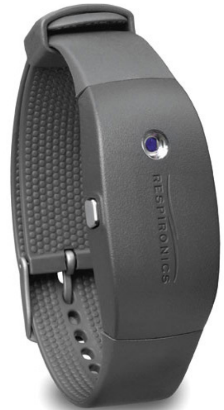
The Actiwatch 2 is used to provide measures of sleep onset, total sleep time, awakenings, and sleep efficiency.

The Actiwatch 2 (Bio-Lynx Scientific Equipment Inc., Montreal, QC) is used to provide measures of sleep onset, total sleep time, awakenings, and sleep efficiency. Data are recorded in 1-min epochs. A small pilot study involving 24 individuals (different from those selected