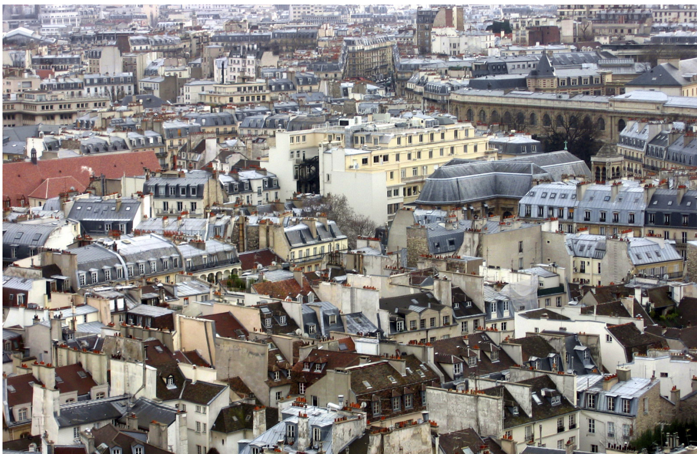
At least 1 million healthy life years are lost every year from traffic-related noise in the western European countries.

the WHO itself has undertaken work in recent years on setting goals guidelines for noise exposure. The document on Community Noise Guidelines was produced in 1999 3 and in 2009 has been followed up with Night Noise Guidelines For Europe 4 , and further reports are being prepared.