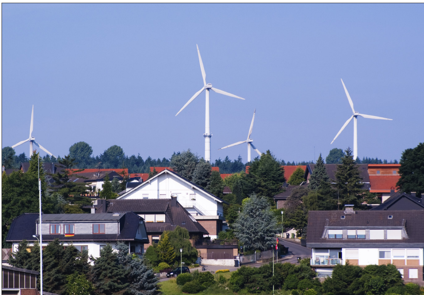
There is public concern for potential health impacts, which include disrupted sleep from exposure to wind turbine sound (WTS).

Expert Committee e , Health Canada's Science Advisory Board, World Health Organization (WHO)-selected advisors, and other professionals with expertise in the field of acoustics and social and direct measures surveys. The study design underwent further review subsequent to a 60 day public consultation period.