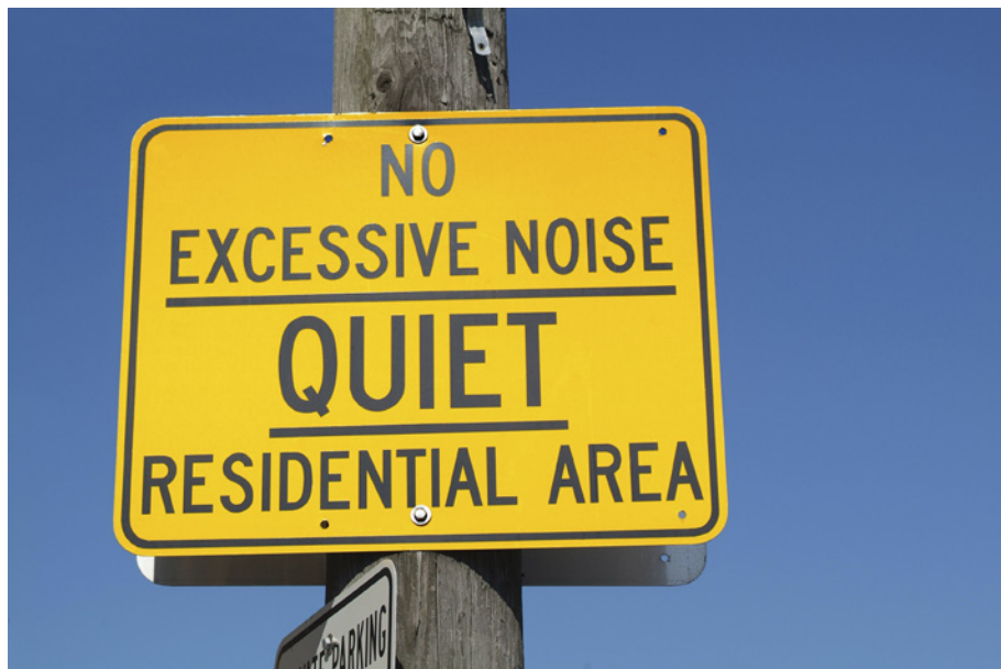
While noise from transportation clearly affects the greatest number of persons across the globe, there are other sources that lead to annoyance reactions in the community.

Another example when the usual method for assessing noise has limitations is for recreation activity noise such as from motor sports venues. When it is a major race through the main streets, or when residential areas are close to a facility, the noise may be dominant and clearly be heard and measured for comparison with the guideline noise limits. However at greater distances the noise from the vehicles on the track may be well within the ‘background’ but can be clearly identified. In part this may be due to the frequency characteristics of the vehicle noise, in part it may be due to the short