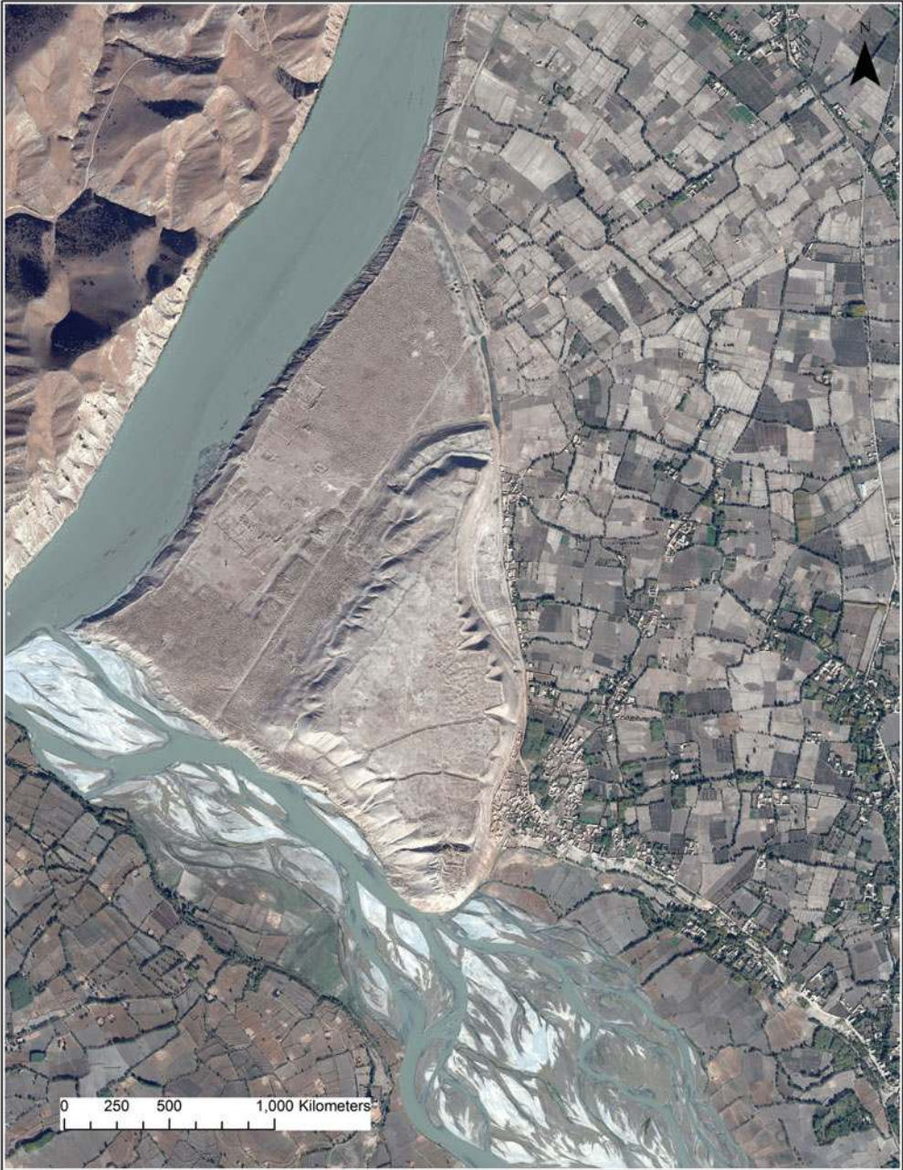
Figure 1. The archaeological site of Ai Khanoum, in Takhar Province, north-eastern Afghanistan. (WorldView-2 imagery, dated 8 November 2010.)