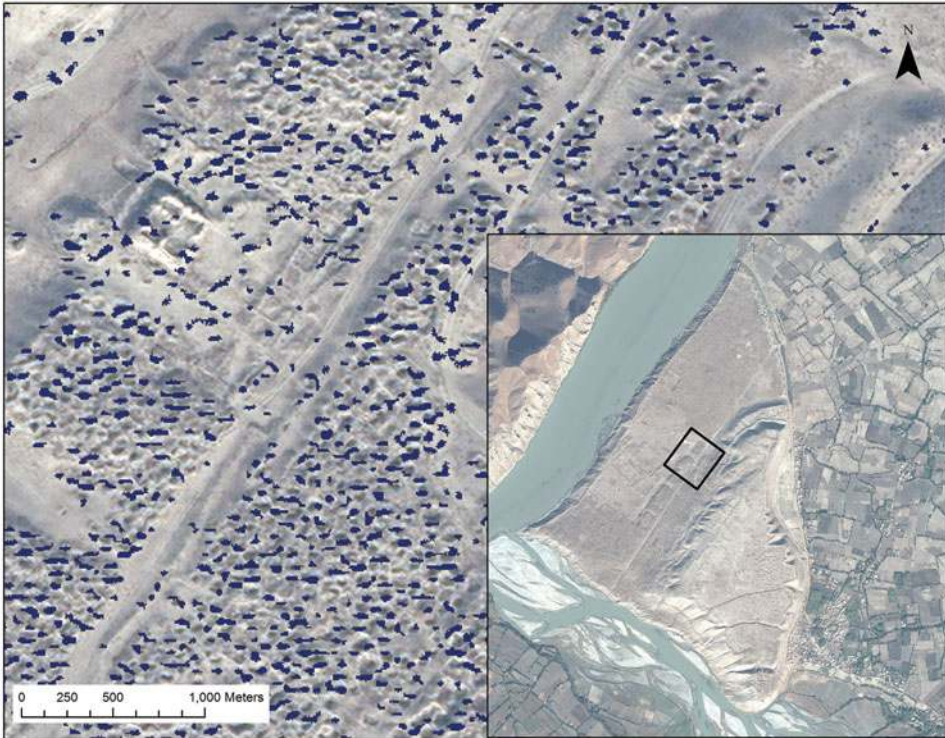
Figure 3. Pit polygons modelled with interactive, supervised classification of principal component raster at the site of Ai Khanoum, Afghanistan. Inset: the location of the area of the site shown in the figure. (WorldView-2 imagery, dated 8 November 2010.)

The method allows us to quantify the amount and intensity of looting at Ai Khanoum to an extent that would be impossible using manual methods (Figures 3 & 4). Using the procedures described above, we conclude that the number of looting pits at Ai Khanoum was 21 095 in November 2010. The total surface area of the pits is estimated at 149 041m 2 , representing approximately 17 per cent of the surface area of the site. This study is the first quantitative characterisation of the extent of looting at Ai Khanoum, and provides a baseline for determining whether looting has continued at the site since 2010.