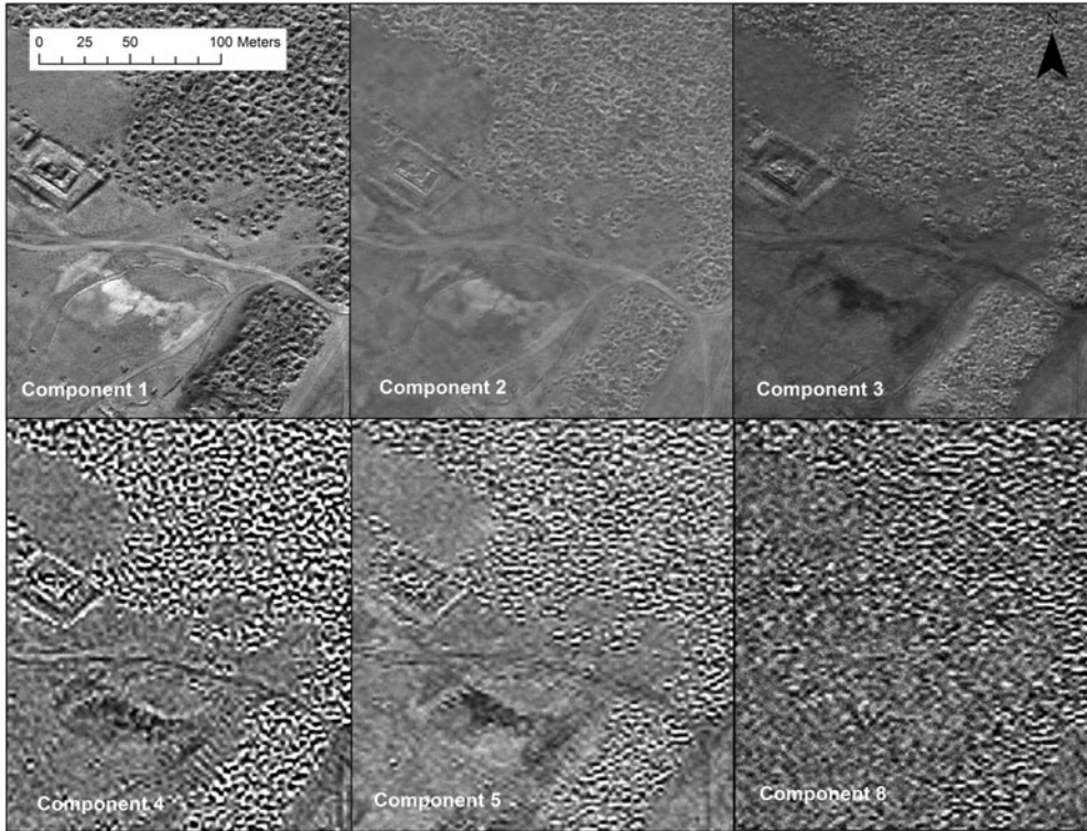
Figure 2. Satellite imagery showing part of the site of Ai Khanoum in Afghanistan. The six boxes show different features highlighted by each component of the principal components analysis. Note that looters' pits are most clearly contrasted with their surroundings in component 4. Higher components have diminishing clarity. (WorldView-2 imagery, dated 8 November 2010.)

Other false positives do not take a shape common to most looting pits and can be excluded on the basis of their geometry. An index of circularity equal to 4\pi \cdot \text{area} / \text{perimeter}^2 allows the removal of improbable shapes, particularly long, linear features such as ditches or canals that do not usually represent looting.