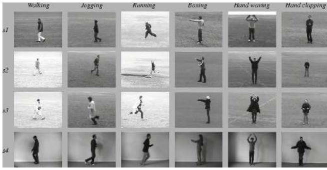
Fig. 1. Video frames from the KTH action database for the four different scenarios.

with that of other methods evaluating their performance on the above-mentioned databases.