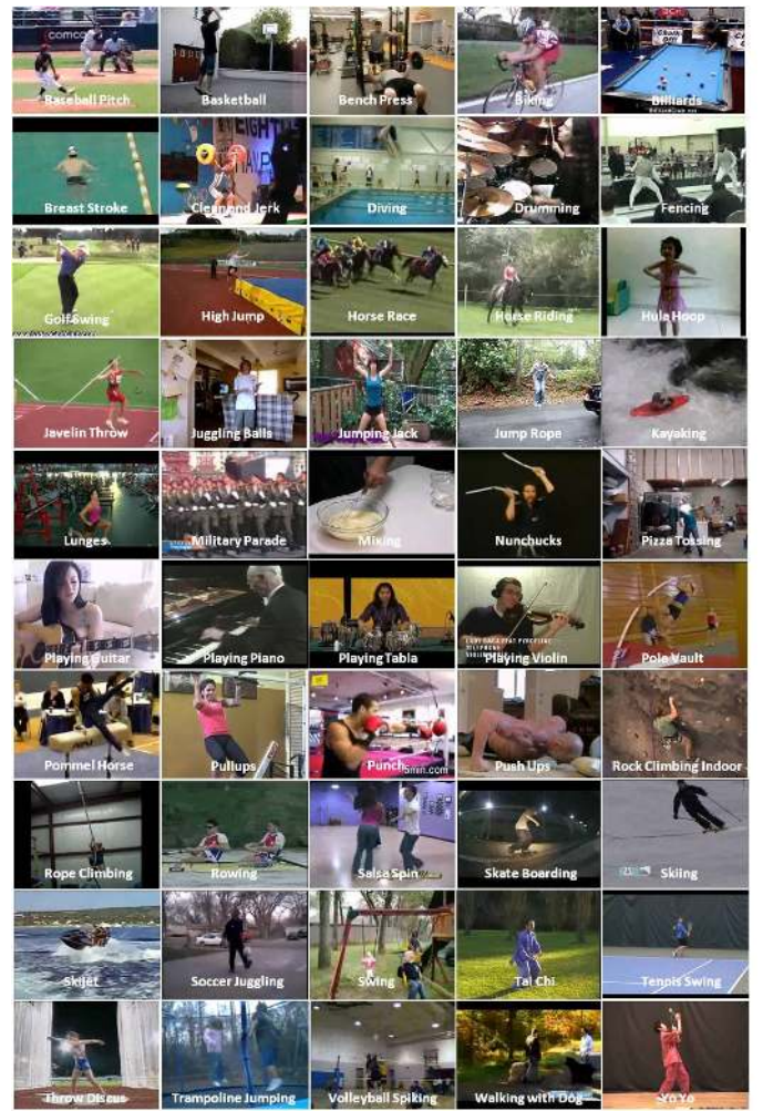
Fig. 2. Video frames from the UCF50 action database.

The mean action classification rates for the ELM, ORELM, kSVM algorithms and the proposed SDELM algorithm employing S_w and S_T for supervised action classification, i.e., by exploiting the available labeling information for the entire training set, are illustrated in Table I. As can be seen, the proposed SDELM algorithm outperforms all the competing