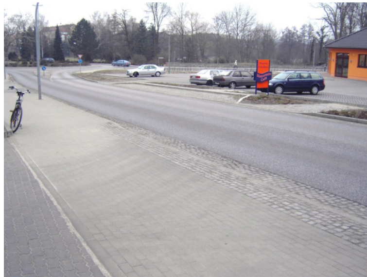
Figure 4: Urban sprawl is accompanied by an increase in impervious surfaces with well-known environmental impacts.