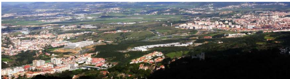
Figure 5: Panorama of a semi-urban landscape seen from the hills of Sintra, north of Lisbon, Portugal.

A specific method of studying urban fringe systems and sprawl, which is related to urban cores, is gradient analysis. Good examples of this method are the studies of McDonnell (McDonnell and Pickett, 1990; McDonnell et al. , 1997), the detailed rural–urban gradient analysis of the area around Phoenix by Luck and Wu (2002), and the GIS based gradient analysis of the urban landscape and sprawl dynamics in China, in Shanghai (Zhang et al. , 2004) or Guangzhou (Yu and Ng, 2007). Other rural–urban gradient studies cover ecological indicators (McKinney, 2002), residential building patterns (Weng, 2007), land use properties like vegetation type (Zhao et al. , 2007), sealed surfaces (Jennings et al. , 2004), or building densities (Longley and Mesev, 2002).