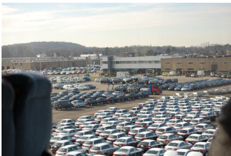
Figure 2: A typical form of urban fringe land use: retail and storage facilities in the countryside between Leuven and Brussels, Belgium.

as a socio-economic instrument in urban fringe regions. An example of econometric modeling in fringe areas, where the competition between residential and agricultural land use is explained using variables like distance to the nearest town or metropolitan area (Chicago in this case) can be found in the work by McMillen (1989) .