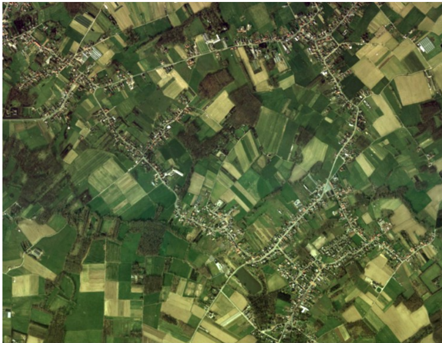
Figure 1: Ribbon-building in the Flemish countryside

important agricultural production. In contrast with other European countries like the Netherlands, the United Kingdom, or Germany, Belgium (and thus Flanders as well) had a very liberal spatial planning policy since the 1950s, which resulted in the fact that the majority of the countryside of Flanders has a somewhat urban character. Especially the central part of Flanders now can be described as a very hybrid matrix of countryside, containing a few big cities, some towns, many smaller settlements and this all connected with very dense infrastructure networks, not seldom accompanied by vast linear areas of ribbon-building. Hidden behind these built-up structures, a considerable acreage of agricultural and natural open space (as opposed to urban 'closed' space) is still present, be it highly fragmented. With these properties combined, the Flemish landscape outside the city limits in many cases resembles neither countryside, nor cityscape but in fact something 'in-between': large areas of Flanders can thus be seen as a good example of a 'semi-urban area'. Flanders is not a unique case; there are other regions with apparently the same characteristics, for example the Lisbon province north of the city of Lisbon, Portugal, the Veneto province in Italy, the Département Nord in the North of France, or the Mediterranean coastal regions of France and Cataluña, Spain.