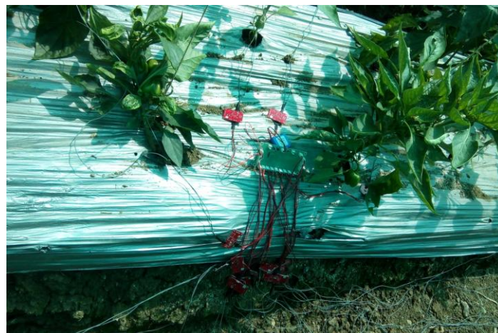
Fig. 3. Slave card