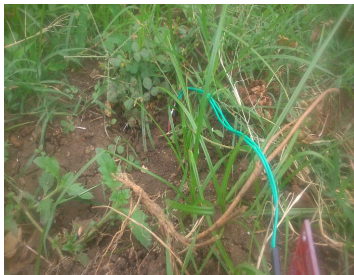
Fig. 2. Soil moisture sensor mounted near roots