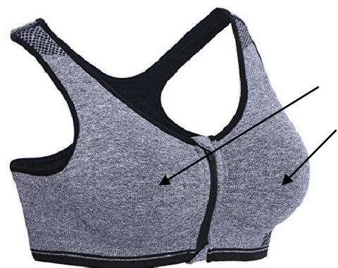
Fig. 1: Spandex fabric material Jacket and arrow marks shows sensor embedded patch position To adjust to all categories of women I supposed stretched type of cloth to design the tool. Spandex is the ultimate stretch fab-

Through the use of sensor-based wearable innovation, client side effects can be checked, investigated and analyzed easily and fast. As part of my proposed work, to get breast health information or breast images we are going to place the sensors very close to the chest part of body. If we attach the sensors directly to the chest, it may cause side effects. So I am going to propose a bra (sleeveless jacket) type jacket for designing a sensor enabled tool. A bra is a form-fitting undergarment designed to support or covers the wearer's breasts. It is very close to the chest and in today's life style for fashion or culture names every woman uses this jacket in regular life [19]. If we design any shirt type jacket that is not close to the chest part and elder women may not feel comfortable. But bra is just like sleeveless jacket so it is very comfortable to all ages of women. To find breast abnormality I am proposing a Bra type sensor enabled wearable technological tool. In my proposed bra type tool, if the hook of the bra is at back side the older women needs the help from others to fix the hook while test. To avoid this I am proposing front hook type bra or bra without hooks. Fig 1 shows proposed jacket structure.