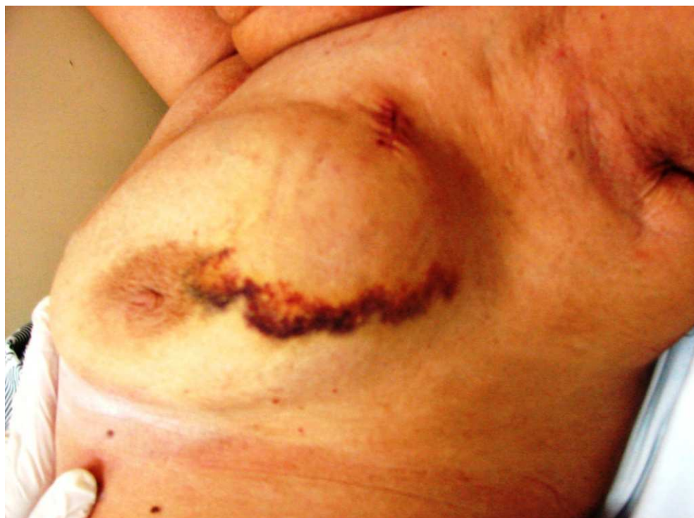
Photo 1. Skin mapped as a lymphatic duct in direction to the axilla

During the management of two patients submitted to breast biopsy in our service, we observed their skin mapped as the lymphatic ducts draining to axillary lymph nodes (Photo 1).