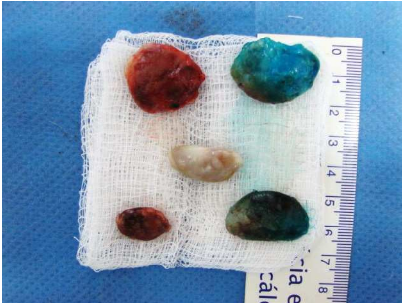
Photo 2. Sentinel lymph nodes marked with hemosiderin at left and with patent blue at right. Non-sentinel lymph node in the middle.

In bid to replicate what was seen in patients, we developed an experimental protocol for obtaining a marker derived from blood and tested in a model of experimental surgery in dogs (Photo 2).