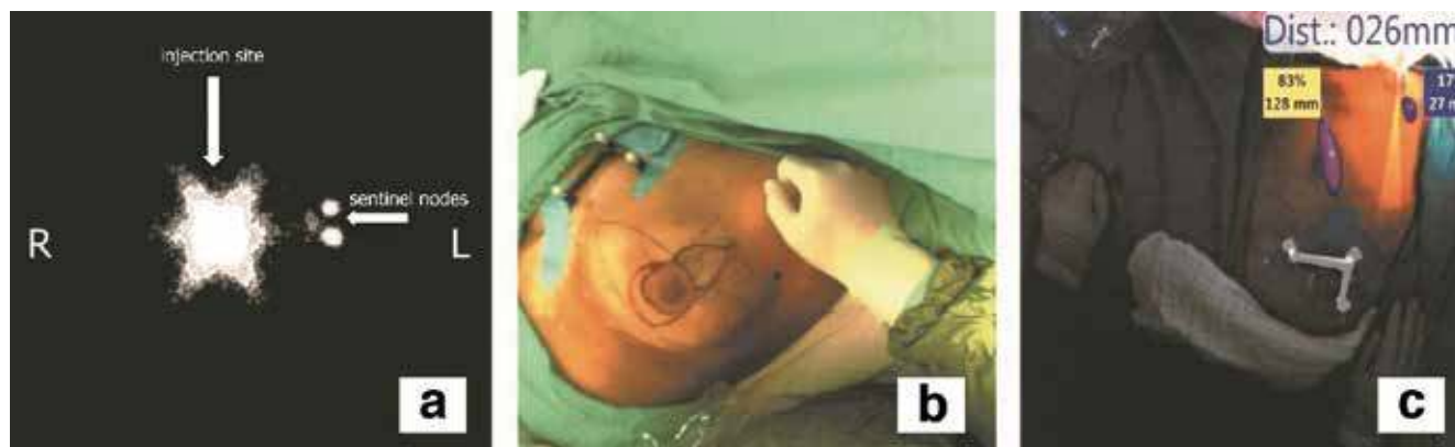
Figure 1. a) The lymphoscintigraphic image of the left breast on the left anterior oblique projection 30 min after radiotracer injection shows tracer accumulation in the injection site (long white arrow) and two adjacent axillary sentinel lymph nodes (short white arrow), b) The view of the operation theatre. Skin mark belonging to the sentinel lymph node is seen in the left axillary region, c) In the operating room, live video image shows two distinct radiotracer uptake foci in the injection site (rate: 83%, depth: 128 mm) and axillary region (rate: 17%, depth: 27 mm)

A 40-year-old premenopausal woman had a 21x15 mm mass in the upper-outer quadrant of her right breast compatible with BI-RADS 4c score on breast ultrasound and mammography. The patient was classified as Stage IIA (T2N0M0) breast cancer according to the imaging studies. A tru-cut biopsy was reported as infiltrative ductal carcinoma. Preoperative lymphoscintigraphy and F-SPECT guided surgery was performed using same radiotracer, injection and imaging techniques with the one-day protocol. Scintigraphic examination showed high nodal uptake in the right axillary region and this area was marked on the skin. 4 hours after radiotracer injection, breast surgery was started with the guidance of 3D F-SPECT imaging. The real-time image from 3D F-SPECT detected meaningful radiotracer uptakes in two hot spots on the injection site and the right