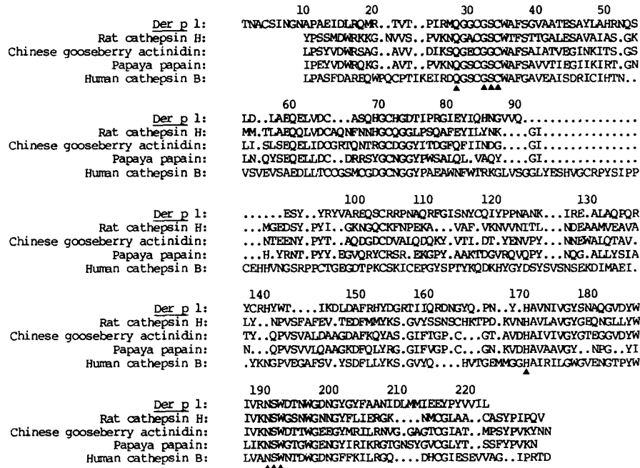
FIGURE 3. Composite alignment of the amino acid sequences of Der p 1 , papain (15), actinidin (16), cathepsin H (17), and cathepsin B (18) (pre- and proregions omitted). Gaps were added to maximize similarity and the arrows indicate those residues making up the active site of papain as deduced by x-ray crystallograph (15).

the NH 2 -terminal region as well as with internal sequences derived from analyses of tryptic peptides (Fig. 2). The complete mature protein is coded by a single open reading frame terminating at the TAA stop codon at nucleotide position 736–738. At present, it is not certain whether the first ATG codon at nucleotide position 16–18 is the translation initiation site, since the immediate flanking sequence of this ATG codon (TTGATGA) showed no homology with the Kozak consensus sequence (ACCATGG) for the eukaryotic translation initiation sites (14). In addition, the 5' proximal end sequence does not code for a typical signal peptide sequence (see below).