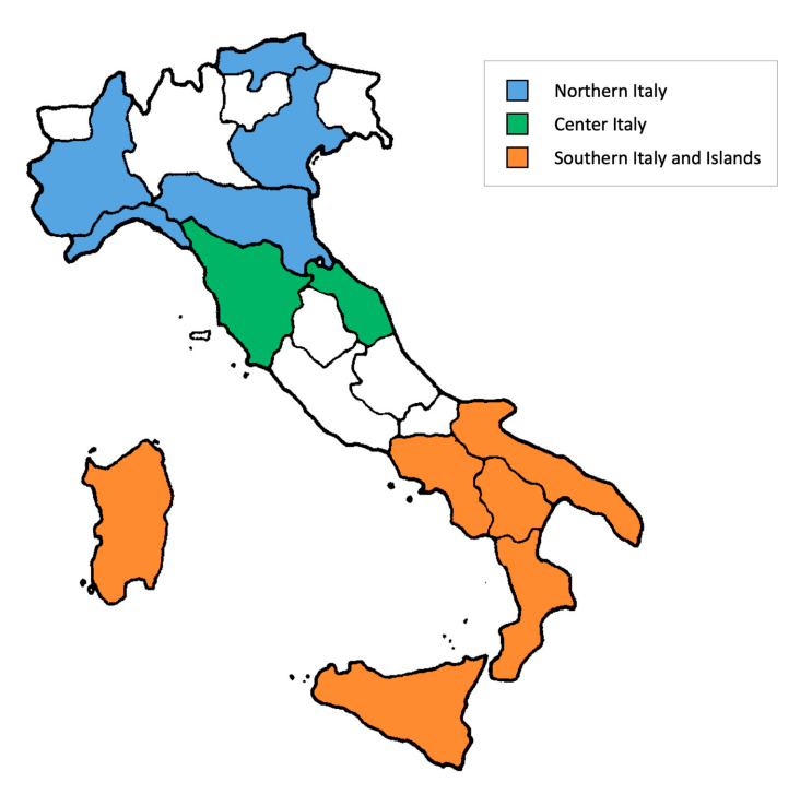
Figure 1. Regions participating in the study divided by geographical area.

The total number of sera to be collected was calculated taking into account that the study has been designed to evaluate the sero-prevalence against a number of vaccine-preventable infectious diseases. The sampling protocol for each regional center was in accordance with the estimates made during the seroepidemiological studies conducted within the European ESEN (European Sero-Epidemiological Network) project [12–16], in which samples were taken for the national seroprevalence studies conducted in 1996, 2003–2004 and 2013–2014. Nowadays, available samples have been collected (period June 2019–May 2020) from 13 regional centers, (Northern Italy: Autonomous Province of Bolzano, Emilia-Romagna, Liguria, Piedmont and Veneto; Central Italy: Tuscany, Marche; Southern Italy and Islands: Basilicata, Calabria, Campania, Apulia, Sardinia, Sicily) (Figure 1).