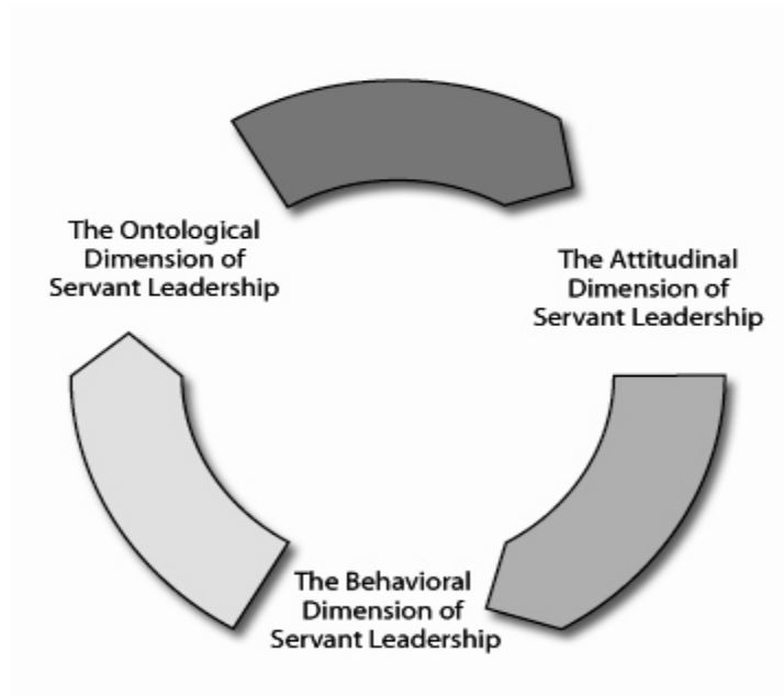
Figure 2. The three dimensions of servant leadership, a circular model.