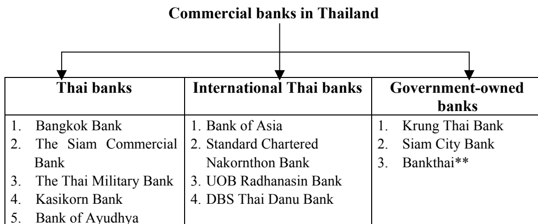
Figure 1: Groups of commercial banks in Thailand

(Source: Adapted from Pukapan, P. & Trisatienpong, P. (2001), The Commercial Bank Management , Jamjuree Products, Thailand, pp. 36)