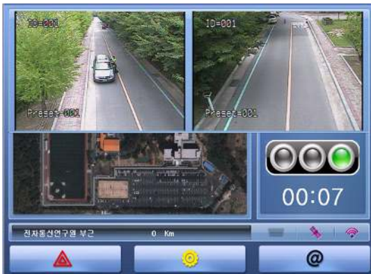
Fig. 2 Display example of intersection safety supporting service and traffic light information service.

information, the status of vehicle, drivers' driving habit, and traffic information of road are provided.