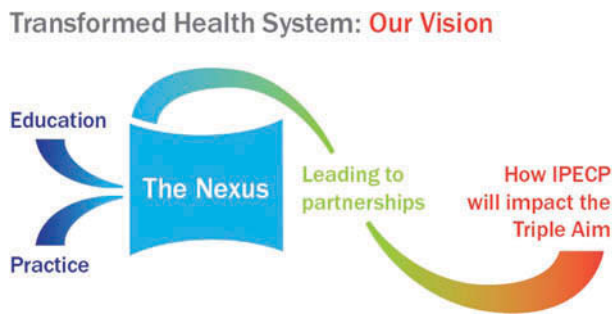
Figure 1. The National Center Vision. © The National Center for Interprofessional Practice and Education. Reproduced by permission of The National Center for Interprofessional Practice and Education. Permission to reuse must be obtained from the rightsholder.

The National Center has established a dynamic incubator network that constitutes a living laboratory to explore the impact of IPECP interventions with outcomes clearly mapped to those of the triple aim. The logic of interventions (Figure 2) is that as they are implemented, they will influence behavior change in those exposed and may result in subsequent changes impacting micro, meso or macro levels of the process of care. If the resulting change is desired it may become institutionalized and an infrastructure will emerge to support and maintain the change. A multiplicity of ecological variables influence the development of such an infrastructure – it is multifactorial and not always predictable. This flows from goals to objective to initiatives or activities to process outputs and then