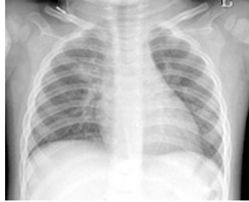
Fig. 3 A 16-month-old girl with probable SARS with recent travel history to Guangdong Province, South China, presented with fever and cough. Initial chest radiograph revealed a patchy opacity in right upper lobe and a mild peribronchial thickening extending into the lower lobes. Subsequent radiographs showed decreased opacity within the right upper lobe and an increased density within the right infrahilar region

Highly contagious, SARS was first identified in Guangdong Province in Southern China late last year. As in other epidemics of the past, trade and travel have sped up SARS transmission between disparate populations. The impact upon affected regions has been significant, both medically and economically. Since SARS