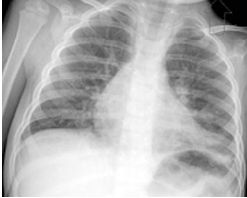
Fig. 1 A 34-month-old boy with probable SARS from household contact. Clinical presentation included fever (41 °C), cough and rhinorrhea. Initial chest radiograph revealed mild perihilar peribronchial thickening and patchy, multifocal infiltrates at the left lung base