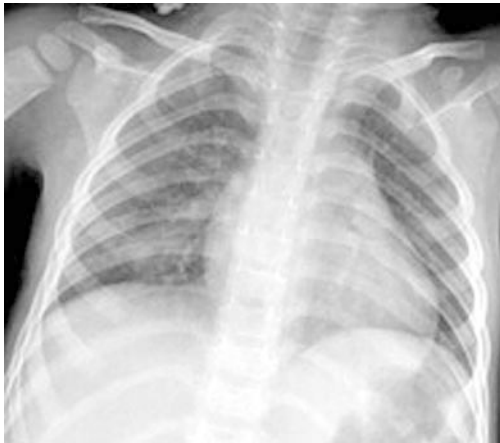
Fig. 2 A 29-month-old boy with probable SARS from household contact presented with fever (38.2 °C) and cough. Initial chest radiograph showed a focal area of airspace opacification in the right lower lobe

children (1–19 years) ranges from 0.5% to 2.5%, depending on age [28]. Based on prospective data collected from pediatric studies of community-acquired lower respiratory tract infections, viral respiratory tract pathogens are responsible for the majority of diagnosed infections in the developed world, particularly in the younger age group [29, 30, 31, 32]. SARS is a new viral disease that must now be considered when faced with a child with fever and respiratory symptoms.