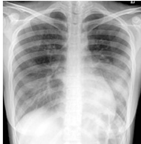
Fig. 4 A 17-year-old girl with probable SARS exposed through household contact. Signs and symptoms of the patient at admission included fever (40.1 °C), cough, dyspnea, hypoxemia, and bilateral crackles. The initial radiograph revealed dense airspace disease involving the right middle lobe and posterior left lower lobe

was first identified, a total of 368 casualties and 2,212 probable SARS cases have been reported from Canada, Singapore, and Hong Kong with additional thousands quarantined. To date there have been limited reports in children [26, 33]. The great majority of SARS victims have been adults [7, 16, 17, 18, 21, 23, 27, 34, 35, 36, 37] with a fatality rate of 9.6% based on WHO surveillance data [10].