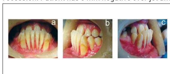
Figure 3. Intraoral view of case.

In this case, occlusal trauma and mucogingival stress could be predisposing factors for gingival recession. Patient has 5 mm negative over jet and