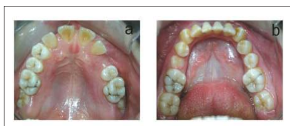
Figure 2. Intraoral upper and lower occlusal view of case.