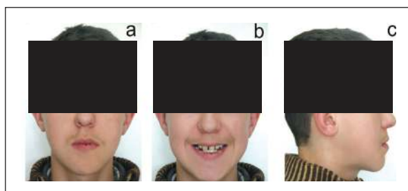
Figure 1. Extraoral view of case.