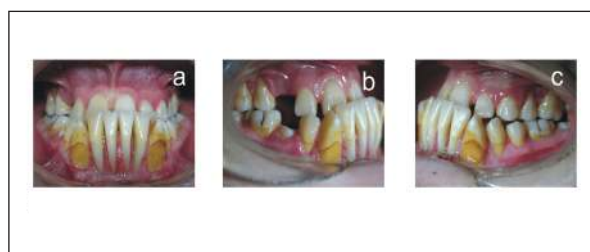
Figure 5. Intraoral view of case at 3 months after surgery.