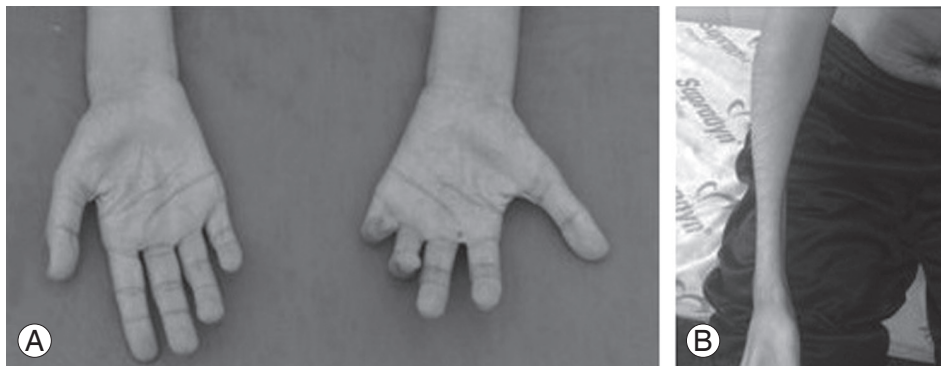
Fig. 1. (A) Hands-palmar view. Wasting of the hands with marked thenar and hypothenar atrophy. (B) Right forearm-midpronation/supination view. Wasting of the forearm with sparing of the brachioradialis muscle (oblique amyotrophy).

Magnetic resonance imaging (MRI) was performed in a General Electric 1.5 Tesla MRI scanner. Cervical MRI (Fig. 2) at a neutral position showed reduction of spinal cord diameter at C5–C6 level with an elongated central