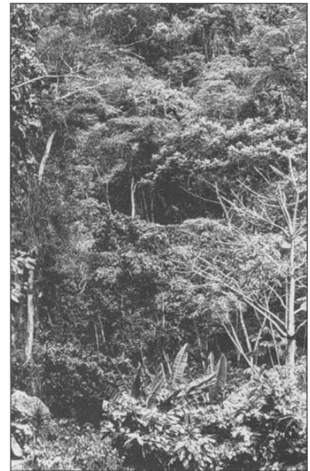
Figure 1. (Left) A sun plantation near San Jose, Costa Rica. (Right) A traditional shade plantation near Tapachula, Chiapas.