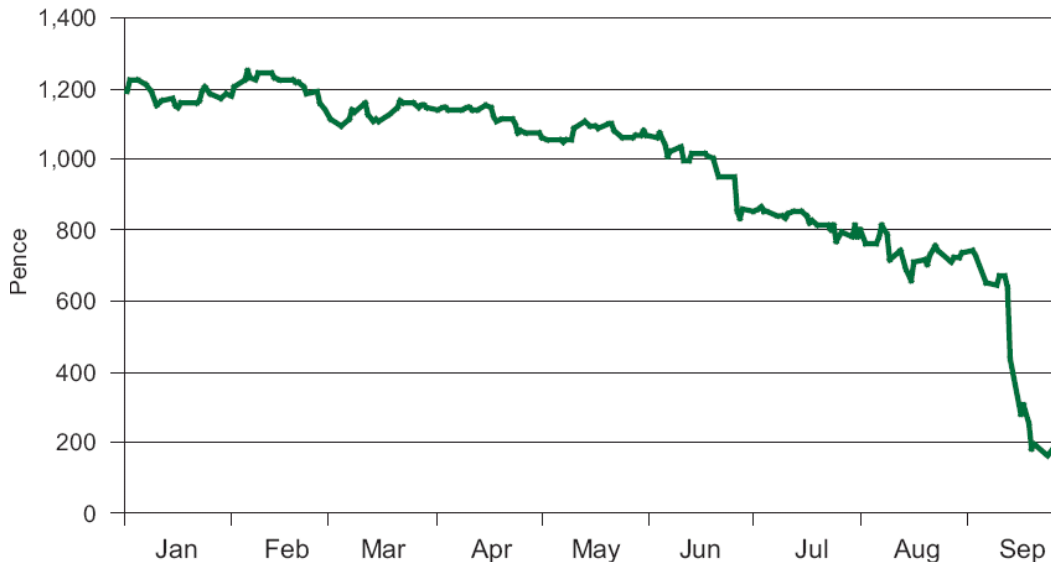
Figure 1. Northern Rock closing share price, January 1997 to September 2007

Bank of England support operation its share price had already fallen by about 50 per cent. 171