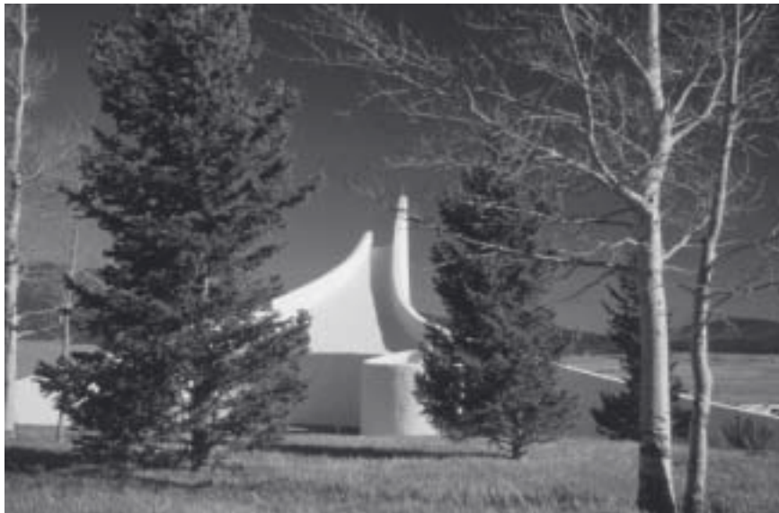
The chapel at the Vietnam Veterans Memorial at Angel Fire, New Mexico, 1998.

The healing circle was repeated in the town park in Salina, Kansas, the next day’s stop. Here, after being fed and entertained by the townspeople, one of the organizers of the event called upon us to form ‘the largest friendship