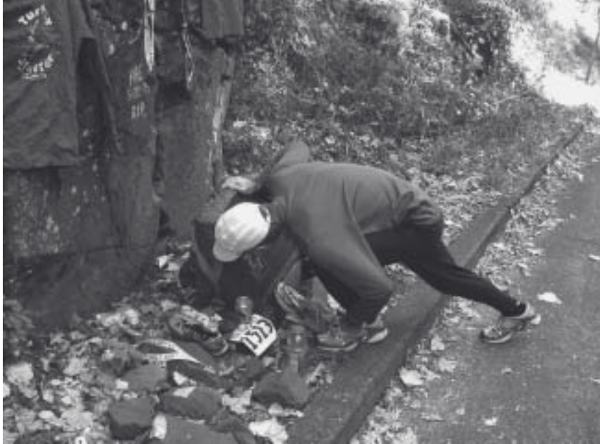
A runner bends down to kiss the image of Prefontaine at his memorial marker, 2006.