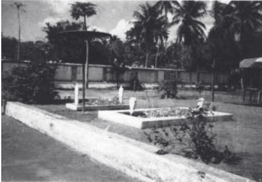
The initial, simple grave (under the black parasol).

his youth and the few visits he made to his parents during his political career. However, he did know the region around Blitar well, as his paternal grandparents lived in neighboring Tulungagung, where he had once stayed for a year as a child. In Soeharto's eyes, these were sufficient reasons to defend the choice of Blitar.