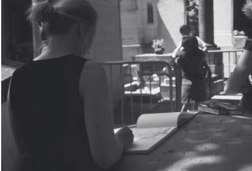
A visitor draws the grave as part of a process of spiritual communication with Jim Morrison.

tours organized by the management of Père Lachaise for those interested in the cemetery and its famous dead (group B), and individuals and families who visit Père Lachaise independently as a cultural-historical monument, perhaps in connection with the celebrity route set out by the cemetery's management (group C). Visits by groups A and B are generally fairly large-scale, quantitatively dominant, and of short duration. They tend to be casual spectators who cast a brief glance at the grave, and who usually just say the singer's name aloud, out of surprise or in verification. For the rest, they include Morrison fans who have chosen this particular excursion so that they can visit the grave in an easy, organized way.