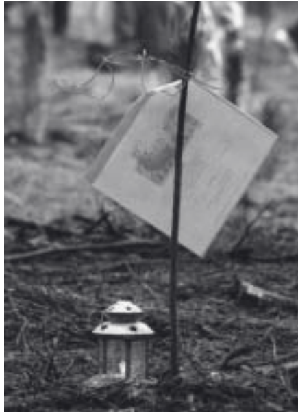
Recently planted tree with letter and lantern.