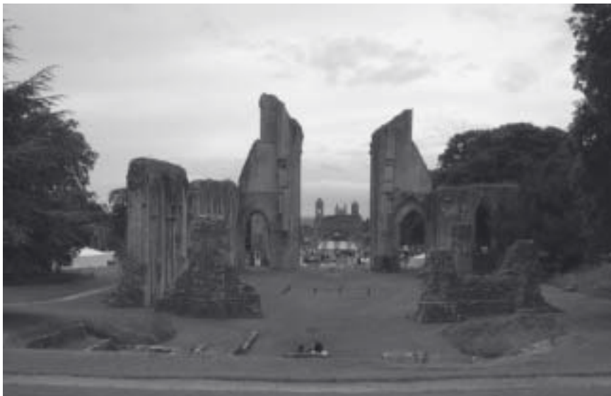
The ruins of Glastonbury Abbey in the centre of town; many non-Christians also regard it as a sacred site for a variety of reasons, 2006.