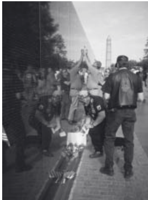
Veterans reach out to touch a Vietnam War memorial in Colorado, 1998.

The carrying of objects on behalf of others, whether they are given by individuals or by groups along the way, connects communities across the country