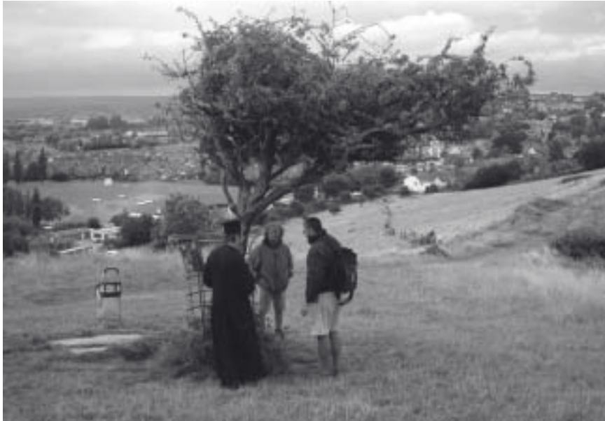
The Blessing of the Holy Thorn on Wearyall Hill by the Celtic Orthodox priest on the Feast of St. Joseph of Arimathea, 31 July 2006. In the distance, also making their way to the Holy Thorn, a procession of Spanish women in Glastonbury as part of a series of pilgrimages throughout Europe 'rediscovering' Mary Magdalen.

Although Glastonbury ceased to be a major Roman Catholic pilgrimage site after the brutal dissolution of the Abbey in 1539, the town continued to attract attention intermittently, and in the late nineteenth/early twentieth centuries there was considerable esoteric Christian activity (influenced by both Theosophy and the Celtic revival), with concomitant renewal of some informal pilgrimage activity. In 1907/1908 the Abbey grounds and ruins came into the possession of a Church of England-based trust, and from 1924 regular Anglican pilgrimage activity was established. On one weekend each summer, there is now an Anglican pilgrimage on a Saturday, followed by a Roman Catholic pilgrimage on the Sunday. Additionally, the ultra-conservative Society of Saint Pius X holds a Glastonbury Pilgrimage on alternate years. In 1978 there was a 15-day Ecumenical Walking Pilgrimage from Arundel to Glastonbury, and various other Christian organizations have visited or held events