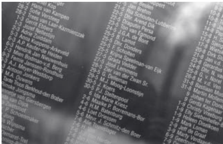
Monumental glass plates with the names of the deceased for whom trees have been planted in the forest.

On arrival at the cleared space in the forest, hundreds of small saplings and many spades are lined up waiting for the visitors. After producing a receipt (proof of order and payment), each visitor is given a sapling and goes off in search of a suitable spot. Some move far away, while others remain close to the perimeter. People often hang something on their tree – a photograph, note, or letter protected by plastic, or a name, poem, doll, or drawing. Small