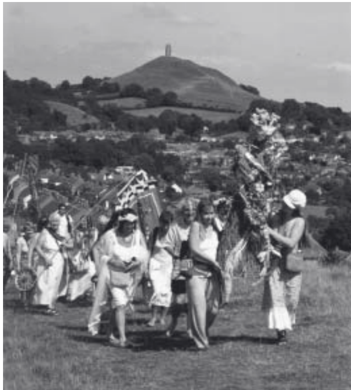
Procession up Wearyall Hill in honour of Bride/Bridget during the Glastonbury Goddess Conference 2004; Glastonbury Tor in the background.