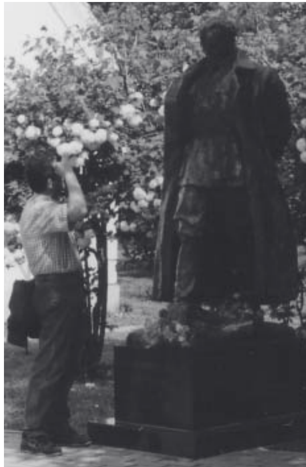
Saluting the statue of Josip Broz Tito, 2004.

This strict adherence to the protocol characterized every delegation. On completion of the protocol, the groups would disband, so it seems that for most delegations laying down the flowers and paying their respects before the