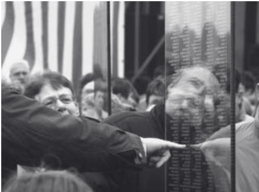
Visitors look for the names of relatives on the glass plates.