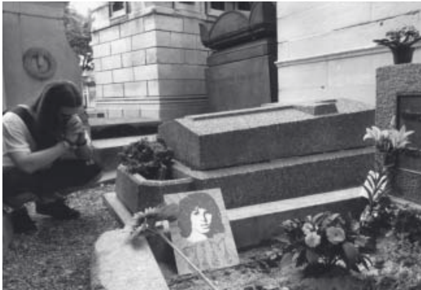
Visitor in reflection at Morrison's grave, 2000.