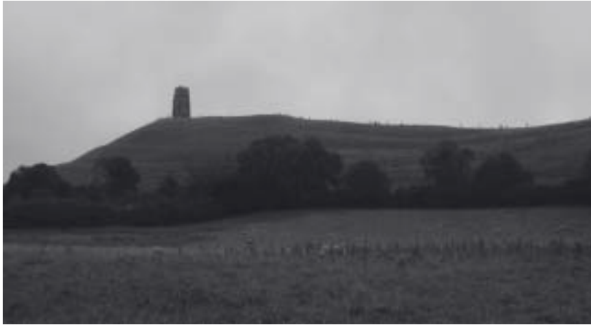
Glastonbury Tor, topped by St Michael's Tower, showing some of the contours that are endlessly speculated upon. It is said that whatever time of day or night you look at the Tor, there is sure to be someone up there, 2006.