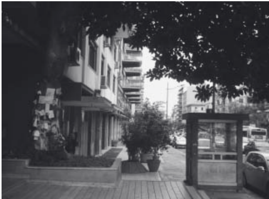
Judge Giovanni Falcone's tree in via Notarbartolo in Palermo, 2006.

Giovanni's two sisters and Francesca's brother and sister, ministers of the Falcone tree cult, have gathered these transient testimonies that are already partly faded by time. Thanks to their efforts to keep the judges' memory alive, I was able to view these messages in a book entitled L'Albero Falcone , which contains the 1992 writings. Some of them are transcriptions, while others, even more interesting for the ethnologist, can be seen in their original form, such as creations that combine drawing, writing, photography, and/or news-