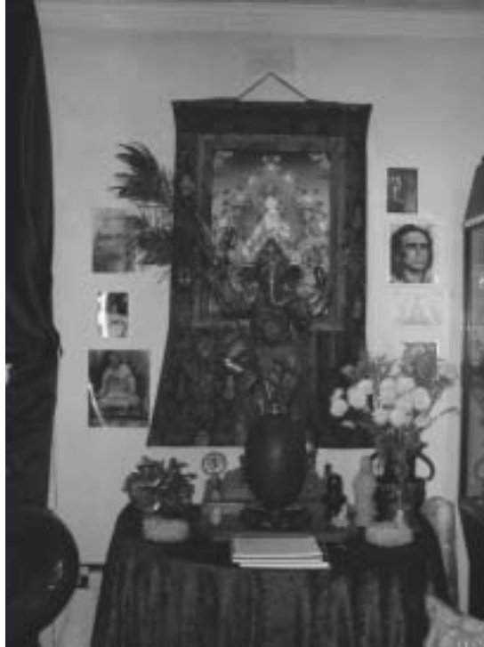
Spirituality and Shopping: Multifaith shrine area in Stone Age, a crystal shop within the Glastonbury Experience courtyard. In addition to assorted crystals and items from Buddhist and Hindu material culture, there are notebooks in which customers can write requests for healing for themselves or others, 2007.