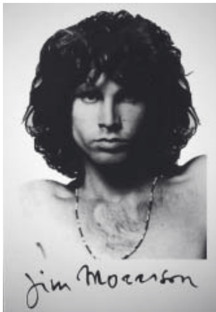
Postcard of a Morrison picture from Joel Brodsky’s Young Lion series of 1967, with signature. Collection Meertens Institute.