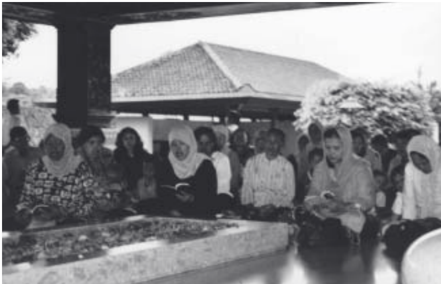
Pilgrims praying at Soekarno's grave, 2007.