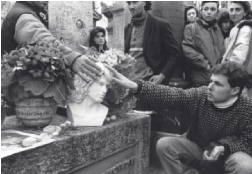
Some visitors experience a strong need to touch the grave and/or bust, 1992.