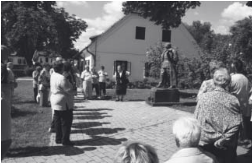
Groups of Croatian and Slovenian visitors in front of Tito's statue, September 2006.