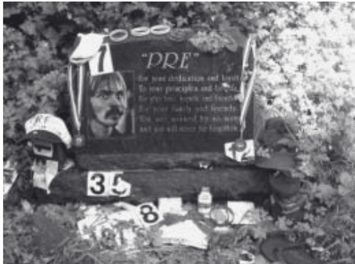
The memorial marker at Pre's Rock and various objects placed at the site, 2005.