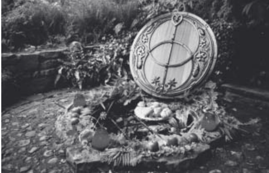
The wellhead at Chalice Well, decorated for Lammas, 2003.