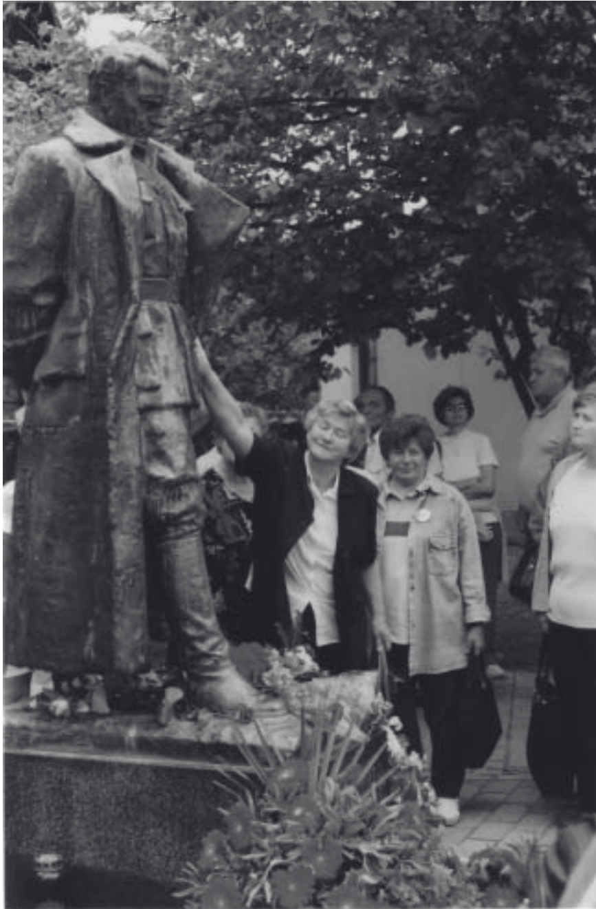
Touching the statue of Josip Broz Tito in Kumrovec, 2004.