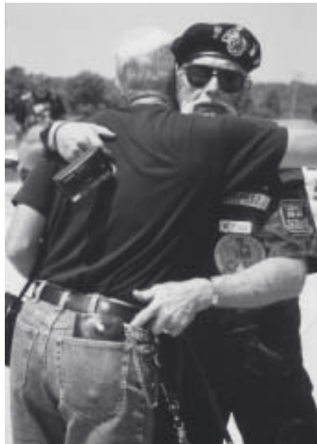
'Welcome home, Brother': Two veterans embrace, 1998.

Healing, then, is an important and often emphasized goal of the Run. Such healing is multifaceted, with social, psychological, and spiritual dimensions. For participants in the Run, healing has several important components. One is being honored for one's service, sacrifice, and suffering after what they perceive as years of dishonor or neglect. Another is feeling welcome in a country in which veterans did not always feel at home upon their return. Thus, the current ritual of saying 'Welcome home, brother' to a veteran becomes part of this healing process. The importance of such a ritual is illustrated by the comment one Run participant made to me after the Run's stop in the small mining town of Reinell, West Virginia. Our reception there, he told me with tears in his eyes, was 'the welcome home I never had.' Another dimension of healing is connection – not only with a society from which the veteran might have felt