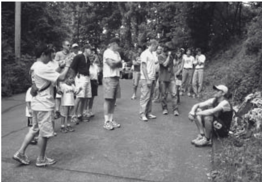
An individual poses for a photo next to the memorial marker at Pre's Rock, as others wait to do the same, 2005.

Pilgrimage sites, as 'energized' and extraordinary places, are points of convergence for communication between humans and deities or supernormal forces, sites where the supernatural is manifested and where divine favors may be attained. The actions and statements of some of those at Pre's Rock reveal the belief that Prefontaine's life-force, essence, or power is present at this place and that it can be experienced here: 'Pre had a tremendous strength and will-power in his life, and great determination, and this is the last place