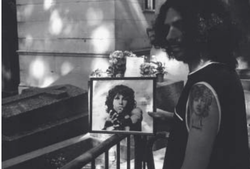
An Italian admirer of Morrison asks for his support, also on behalf of his friends who have signed a card that bears a message, 3 July 2004.