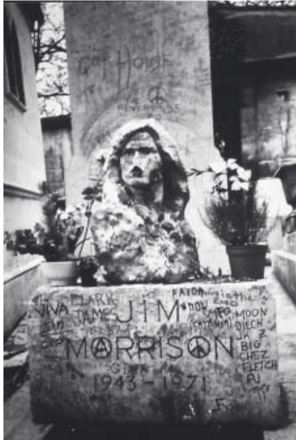
Postcard showing the grave of Jim Morrison adorned with a bust and graffiti, approx. 1987.

focus for visitors and the focal point of an ever-growing social and sacred space, at the same time underscoring the importance of locality in this context (Bennett 2000: 195-198). The literal appropriation of the space by gatherings of Morrison fans was so informal, chaotic and ‘anarchistic’ in nature – fully in keeping with the idol worshipped there – that the site became increasingly contested. This had already led to a temporary closure in 1988-1989 that failed to relocate or eliminate the cult; it would be effortlessly revived again later (Söderholm 1990: 303). Thus, the site continued to exert its power, becoming once again the subject of conflict and eventually being permanently and physically cordoned-off from the public.