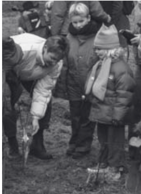
A family plants a tree in memory of a relative who died of cancer.