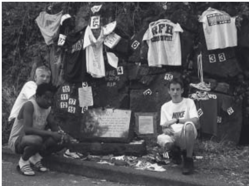
Fans at Pre's Rock and the assortment of objects placed there, May 2004.

sociated with Pre's Rock, and the personal meanings of these practices for the people who travel to the site. For some individuals, Pre's Rock is considered hallowed ground, and it functions as a shrine, a place where they make offerings, seek inspiration and intercession, and communicate with the memory or spirit of Steve Prefontaine. I explore the ways that the site is sacralized by fans, how their ritual actions are expressions of vernacular spirituality, and the degree to which journeys to Pre's Rock may be considered pilgrimages.