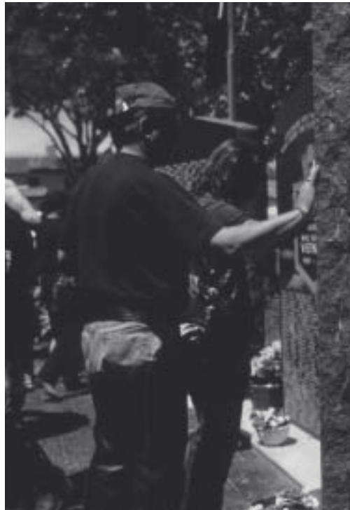
Veterans taking part in the Run for the Wall leave their offerings at the Vietnam Veterans Memorial in Washington DC, 1998.

The Wall is both the destination and the emotional climax of the pilgrimage. On the last day of its journey, the Run enters the nation’s capital, Washington, DC. Parking the bikes in a field across the street from the memorial, the riders pause to collect themselves before moving singly or in groups to confront the memorial. There, face to face with the black granite surface