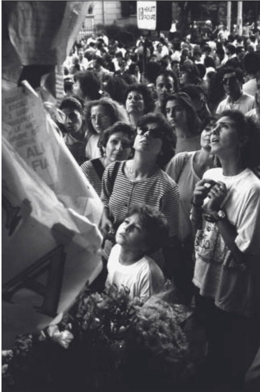
People gather at the tree near the house of Judge Falcone immediately after the announcement of his assassination, 1992.