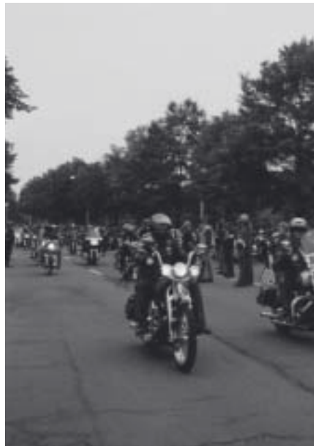
Motorcycles arriving for the Rolling Thunder motorcycle rally, Washington, DC, 1998.