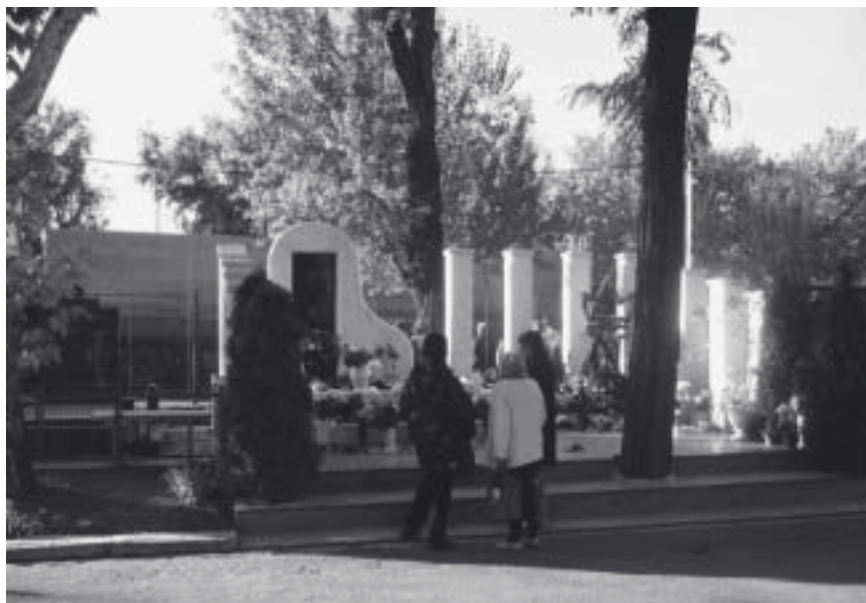
Visitors to Jimmy Zábó's grave monument, 2006.

Besides the pilgrim's personal motivation, it is worth examining the instruments of mourning, especially those that fans brought to the funeral or later on pilgrimages to the grave. I can perhaps venture to state that in this case the usual instruments like night-lights, candles and flowers 35 are not the most important ones for our purposes because they belong to the traditional accessories of cemetery visits. Similarly, this is not the first occasion that we observe a large number of stuffed toy animals (cf. Bowman 2001). It is particularly important to examine three points. Firstly, several Hungarian national flags were flying in the crowd, which is not at all typical of a pop singer's funeral. This phenomenon can be explained by the presence of diasporic Hungarians from neighbouring countries of the former Hungarian empire. For them, Jimmy Zábó was not simply a pop singer; he was also a singer for Hungarians and therefore a special instrument for creating and maintaining Hungarian identity. A 30-year-old man stated in this regard: