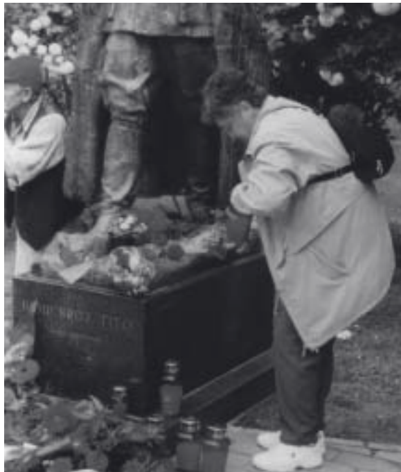
Lighting candles in front of the statue of Josip Broz Tito, 2004.

On that day hundreds of people expressed their experience of the statue in similar ways.