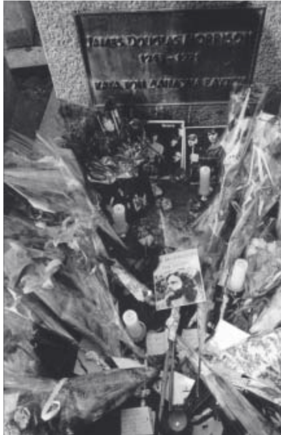
Grave of Morrison with gifts from visitors, 8 December 2003.