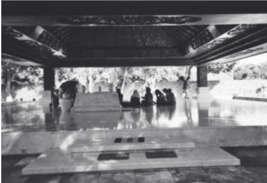
Pilgrims praying at Soekarno's grave, 2007.