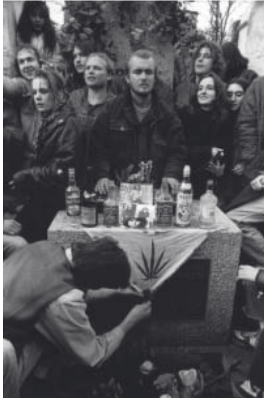
An analogy of the church altar: fanscene has covered the new gravestone for Jim Morrison with drugs and alcohol, 1990.

marked and damaged by graffiti and inscriptions in the thousands. This was the permanent confrontation of the informal Morrison cult with the order and sacrality of the cemetery. Also at that time, in response to the newly launched heritage policy and to burgeoning tourism, the cemetery was declared a historic monument, which meant that Père Lachaise – although still a functioning cemetery – became subject to a process of museumization. This served to heighten tensions with the Morrison scene, who were held partly responsible for stripping the cemetery of almost all of Morrison's funerary paraphernalia.