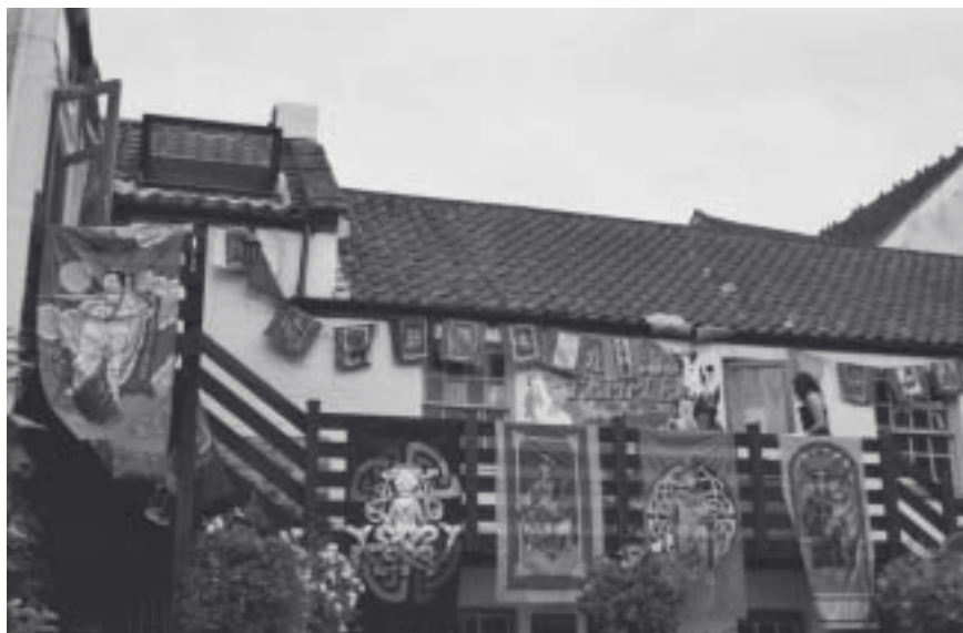
Exterior of the Goddess Temple in the Glastonbury Experience which demonstrates the broad and syncretistic way in which the Goddess is envisaged and celebrated, 2003.

Goddess pilgrimage activity thus occurs in Glastonbury in a variety of forms and contexts. Urry's 'intense co-present fellow feeling,' 'face-to-face' and 'face-the-place' are particularly marked in the Goddess Conference. Within Pilgrimage Circles and conference workshops and as part of large-scale, exuberant, high-profile processions, people who often follow their spiritual path in isolation can experience community, and as with the Christian pilgrimage weekend, there is also an awareness of public witness and 'reclamation'