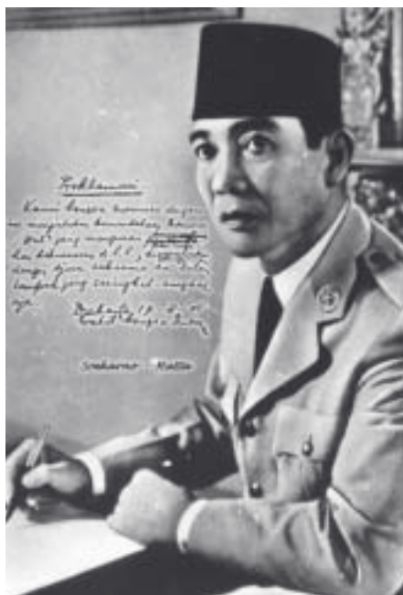
Soekarno in front of the Proclamation of Independence.