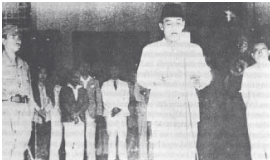
Soekarno reads out the Proclamation of Independence, while Hatta (on the right) listens, 17 August 1945.