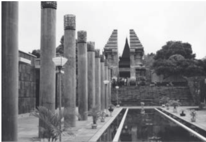
The Soekarno Mausoleum, seen from the library, 2007.

kam Pahlawan area of the cemetery, with the exception of Soekarno's mother, were moved to a new graveyard elsewhere in the city. The new, walled funeral complex, now officially called Makam Bung Karno 11 (Grave of Brother Karno) consists of three levels, from south to north: the courtyard, the terrace around the mausoleum and the mausoleum itself. These levels symbolize the three stages of life distinguished by the Javanese: alam purwo , the time spent in the womb, alam madya , the transient time on earth, and alam wasono , the hereafter. Pilgrims enter the courtyard through an imposing southern gate in the style of Madjapahit, a glorious Hindu-Buddhist empire (1300-1500) whose center was located in East Java. 12 There are two sacred waringin (banyan) trees and two buildings, a small mosque and a rest room where visitors can prepare themselves for the final steps of the pilgrimage. Barefooted, they move on to the bare empty terrace that gives access on all sides to the pendopo , an open-sided, covered building, where Soekarno is buried with his parents. The remains of his father, who died in Jakarta in May 1945, were brought here shortly before the opening. The parents are each entombed, while Soekarno