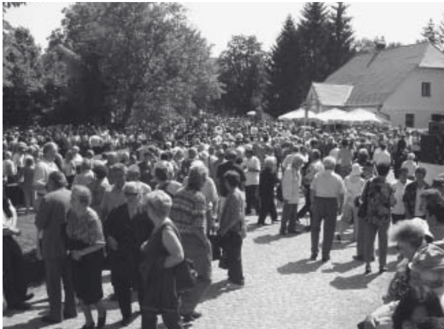
Celebration of the Day of Youth in Kumrovec, 2004.

However, in spite of all attempts to remove traces of Yugoslavian nation-building symbolism which had been sedimenting for years, once a year Kumrovec turns into a destination for several thousand Tito admirers from all over former Yugoslavia, who go there to celebrate the Day of Youth.