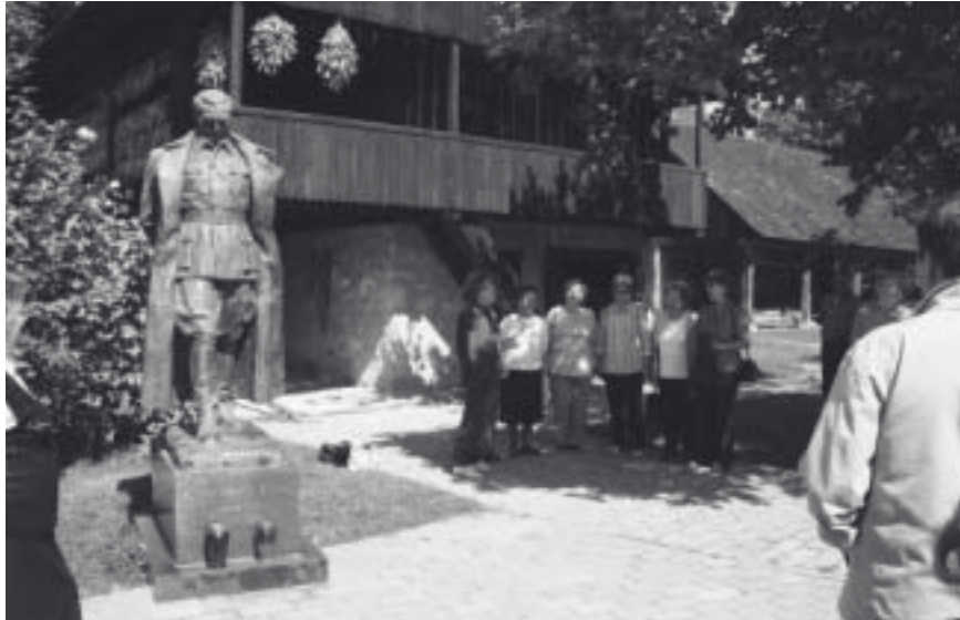
Slovenian women from the city of Koečevje, which is near the Croatian border, singing Tito's favorite folk song (Pleničke je prala pri mrzlem studenc), September 2006.