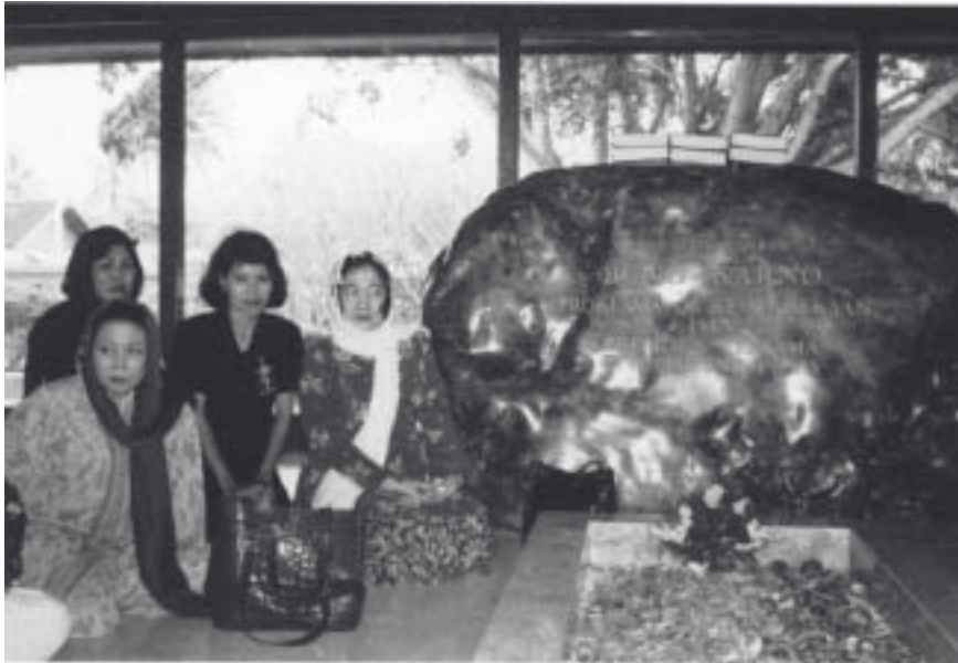
Megawati Sukarnoputri (on the right) at her father's grave in the 1990s.