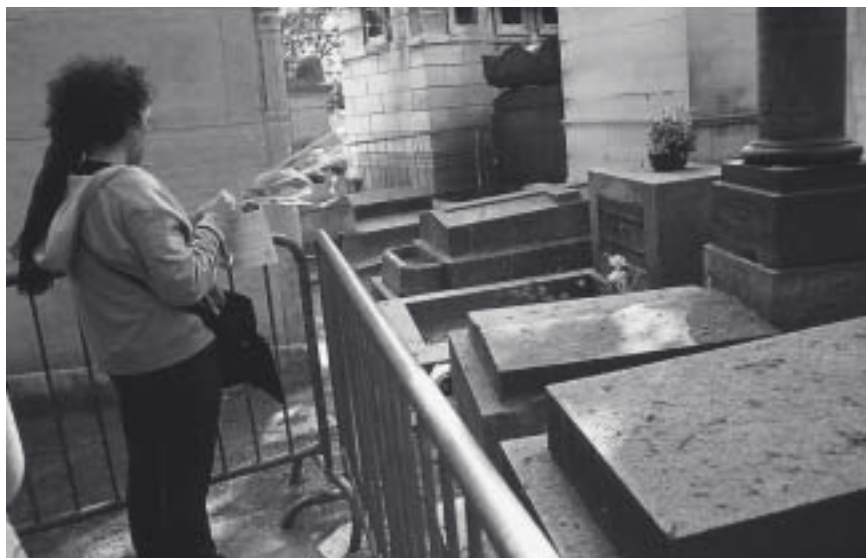
Visitor to the grave, May 2004.