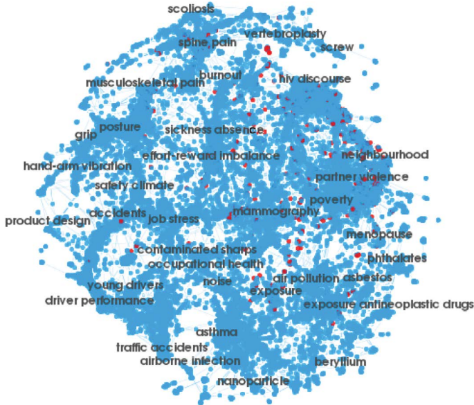
Figur 1: A visualization taken from Sandström (2013, p. 56) of the bibliometric study on work environment research (medical, natural, and technical sciences) published in identified peer-reviewed journals. The red color represents gender-related research and blue color gender-neutral research in this area.

men. Analyses of work-related factors and their effect on health based on gender theory have been rare. The empirical focus of the two predominant research areas when it comes to work health—safety at work and hygiene factors, has been on the working life of men. Men are also the group that, based on a normative assessment, take more risks than women, and therefore benefit more from the results of the first research area mentioned.