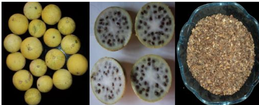
Fig-1: Thumba Fruits and Thumba Seeds