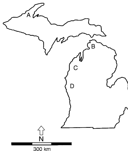
FIG. 1. The distribution of study sites spanning the geographic range of northern hardwood forests in lower and upper Michigan, USA. Individual study sites were selected from a larger pool of candidate sites due to their similarity of floristic and edaphic characteristics. In each study site, three plots ( 50 \times 50 \text{ m} ) received ambient atmospheric N deposition, and three plots received an additional 3 \text{ g NO}_3^- \cdot \text{N}\cdot\text{m}^{-2}\cdot\text{yr}^{-1} since 1994.

only after ^{15}\text{N} -enriched leaf litter was shed by the canopy.