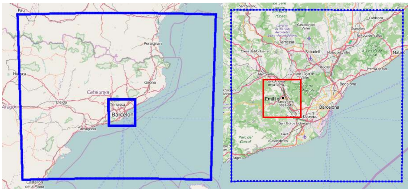
Figure 1. Models domains for simulation (left). Zoom of the inner domain. The red domain is the one used in the finite element model with the emitter position (right).

The area of interest is in the surrounding of Barcelona. We will study the emission of a large emitter of SO 2 in the atmosphere. In Fig. 1 we show the simulation domains used by the CMAQ modelling system. In Fig. 2 you can see a zoom of the smaller domain, and the location of the emitter, and the domain of the finite element method. The domain of the finite element model is smaller due to the computational cost.