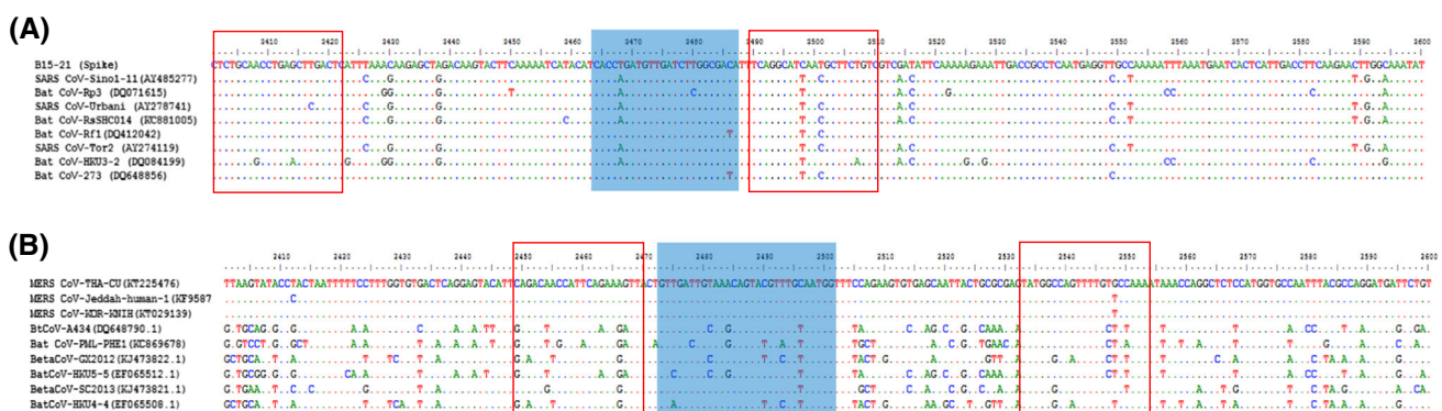
Fig. 1 Multiple sequence alignment of the spike S2 region of SARS-CoV and SARS-like bat CoVs (a) and MERS-CoV and MERS-like bat CoVs (b). Primer-binding sites are indicated by unshaded boxes, and probe-binding sites are indicated by shaded boxes

A SensiFAST Probe No-ROX One-Step Kit (BIOLINE, Taunton, MA, USA) was used for the real-time RT-PCRs. Each 20- \mu L reaction consisted of 4 \mu L of template, 0.8 \mu L of each primer (SCOV-F/R and MCOV-F/R, 10 \mu M each), 10 \mu L of 2X SensiFAST Probe No-ROX One-Step Mix, 0.2 \mu L of each probe (SCOV-probe and MCOV-probe,