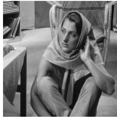
Figure 1: Example of image with both texture and structure.