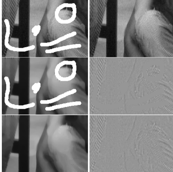
Figure 3: Basic algorithm proposed in this paper. The original image in the first row, left (a section of Figure 1) is decomposed into a structure image and a texture image, [28], second row. Note how the image on the left mainly contains the underlying image structure while the image on the right mainly contains the texture. These two images are reconstructed via inpainting, [4], and texture synthesis, [8], respectively, third row. The image on the left managed to reconstruct the structure (see for example the chair vertical leg), while the image on the right managed to reconstruct the basic texture. The resulting two images are added to obtain the reconstructed result, first row, right, where both structure and texture are recovered.