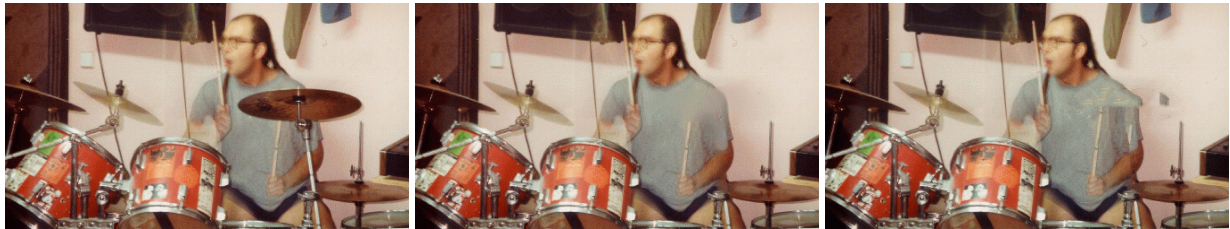
Figure 4: Object removal. The original image is shown first, followed by the result of our algorithm and the result with pure texture synthesis.