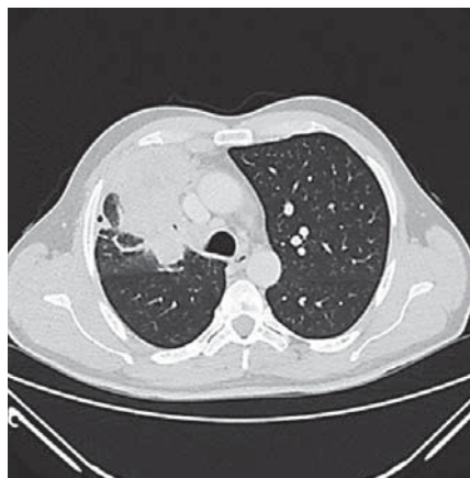
Fig. 1. Chest CT scan at presentation of the disease.

Pixantrone dimaleate (pixantrone), a novel aza-anthracenedione, was initially synthesized to reduce anthracycline-related cardiotoxicity without compromising antitumour efficacy. However, pixantrone shows pharmaco-