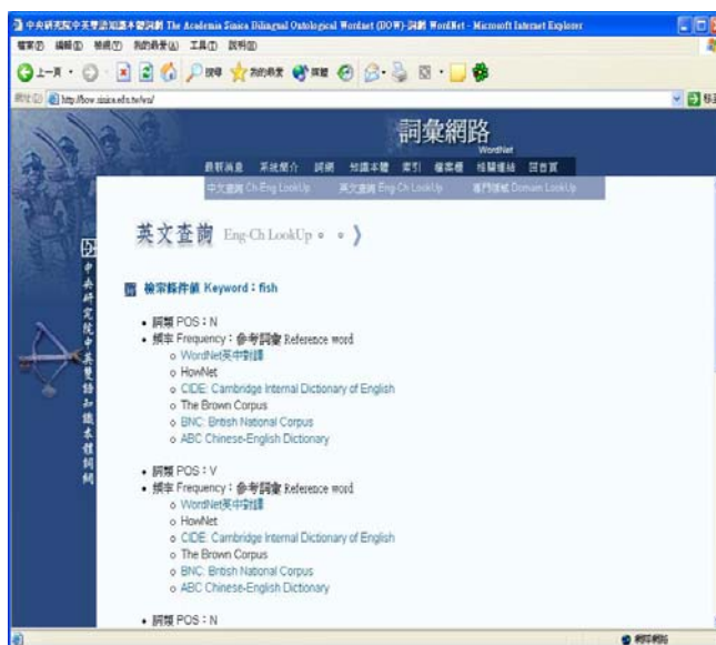
Figure 2: Initial Return of Lemma Search

Since the main goal of Sinica BOW concerns knowledge representation, the lemma based or conceptual node based query results are directed linked to the full knowledgebase and expandable. The Sinica BOW access is lexicon-driven. Each query returns a structured lexical entry, presented as a tree-structured menu. A keyword query returns with a menu arranged according to word senses, as shown in Figure 2. The top level information returned including POS, usage ranking, and cross-reference links. In addition to wordnet information, cross-references to up to five resources are pre-compiled for either language. For an English word, the main resource is of course the bilingual wordnet information that our team constructed. Major outside references are listed for quick hyperlink. These include corpora and both EC and CE dictionaries. For Chinese, the main resource is again our bilingual wordnet. In addition, links are established to Sinica Corpus, to Wen-Land (a learner's Lexical KnowledgeNet), and to online monolingual and bilingual dictionaries. In addition to online access of multiple sources information, each lemma's distribution in these resources is also a good indicator of its usage level.