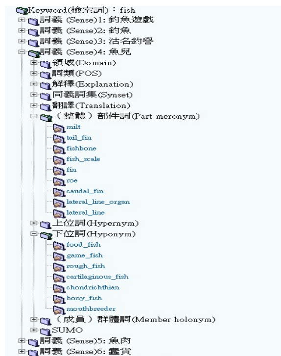
Figure 3: A sample lemma query result of Sinica BOW

Two more aspects of versatility can be achieved through the use of higher level linguistic generalizations and the use of domain taxonomy to organize information. These will be discussed in more details in the next section.