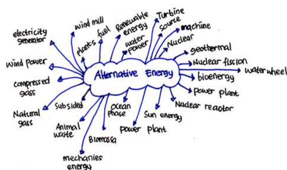
Figure 1. The Ability of Prospective Science Teacher in Determining Science Concepts

This research has collected several data, they are students' ability to define the concept of integrated science, identify the appropriate local wisdom related with certain scientific concepts, and relate the concept of science with local wisdom by analyzing students' mind maps. Mind map produced by students in identifying scientific concepts is presented (Figure 1).