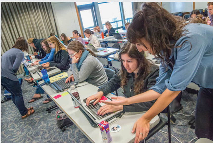
Figure 1. A Software Carpentry Boot Camp for Women at Lawrence Berkeley National Lab.