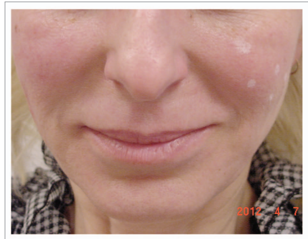
Figure 2. Patient showing the difference of the nasolabial fold: non-treated left side (with site marks for planned HA injection) and right side straight after injection of only 0.5 ml of nonanimal stabilized cross-linked HA ("Stalagmite" technique on the right cheek).

Products injected within or beneath the skin to improve its physical features by soft tissue augmentation are known as