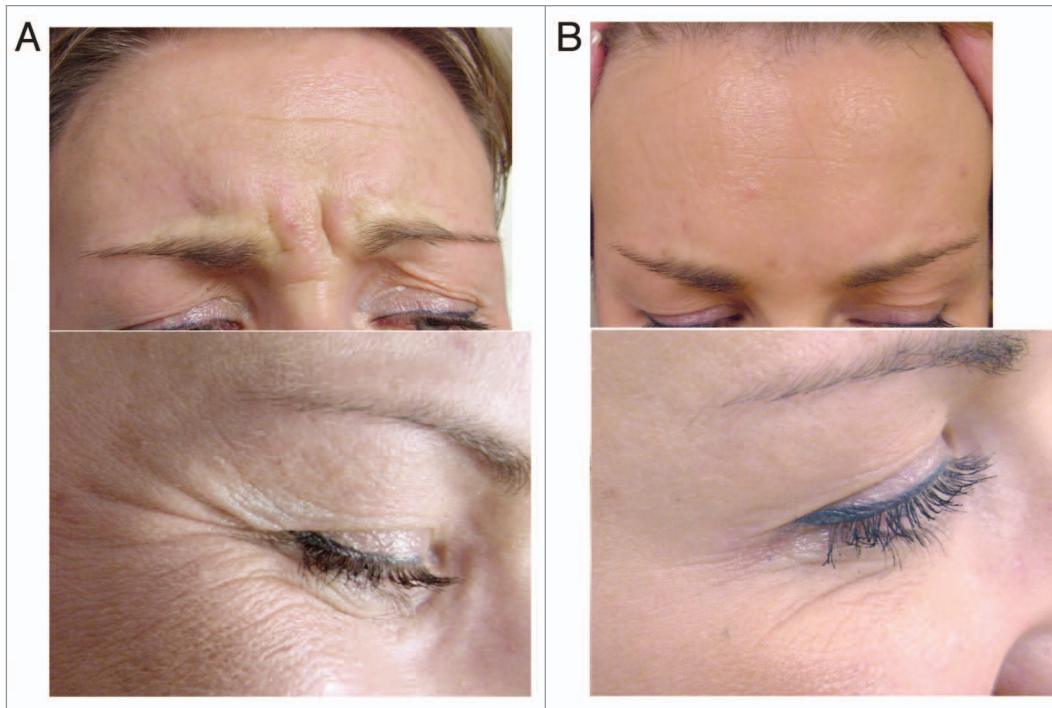
Figure 3. Patient showing glabellar and crow's feet wrinkles. (A) pre-injection, (B) after injection with botulinum toxin.

LD50, so that the FDA classifies BTX-A as therapeutically safe. 183 BTX-A does not cross the blood-brain barrier or pass through the skin. 179