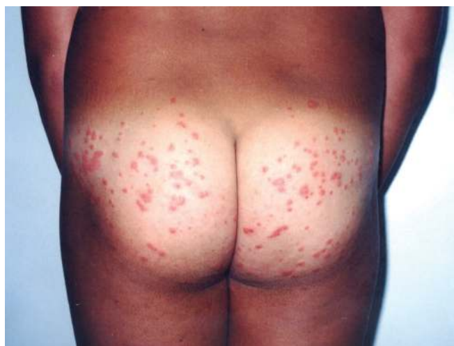
Fig. 6 - Classic skin lesions under swimwear caused by Linuche unguiculata larvae (seabather's eruption).

Portuguese man-of-war and Olindias sambaquiensis (a small hydrozoan responsible for the majority of the injuries in Southeast and South regions of Brazil), this measure is not so certain, as in vitro experiments have shown that nematocysts are discharged from some Portuguese man-of-war specimens when bathed in vinegar or alcohol solutions. In our experience, the application of vinegar is a good first aid measure in accidents by all cnidarians on the Brazilian Coast 2-6 .