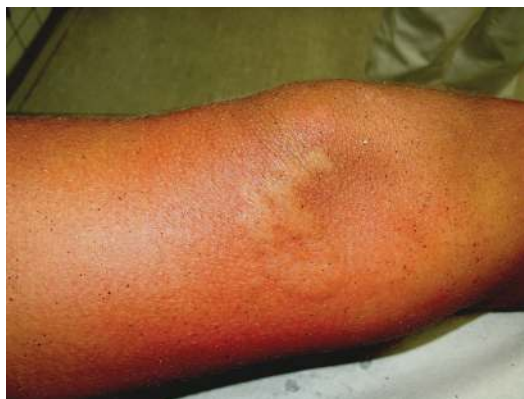
Fig. 4 - Erythematous plaques showing the impression of the cnidarian body are suggestive of envenoming caused by Olindias sambaquiensis .