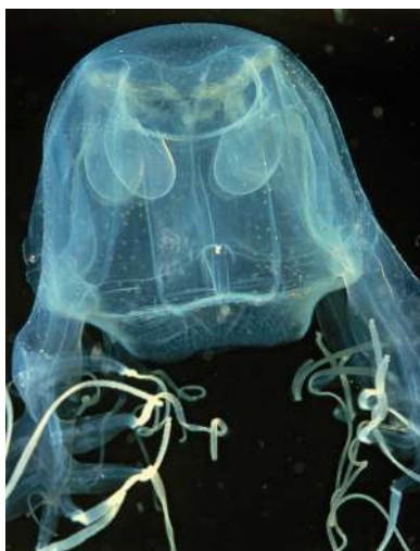
Fig. 2 - Chiropsalmus quadrumanus , an important cubozoan in the genesis of severe human envenoming along the Brazilian Coast.