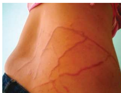
Fig. 5 - Typical envenoming by the box jellyfish or Portuguese man-of-war. Note the intercrossed lines larger than 20 cm.