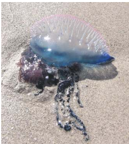
Fig. 1 - Portuguese man-of-war ( Physalia physalis ), a hydrozoa capable of causing severe envenoming in humans.