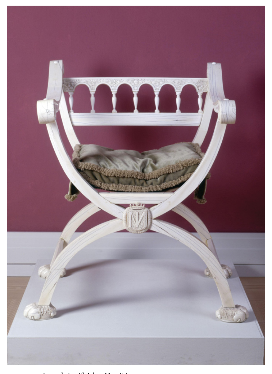
FIGURE 3 Ivory chair with Johan Maurits's monogram SOURCE: STIFTUNG PREUSSISCHER PALASTEN UND GARTEN: SPSG, HM 2701 / IV 424, PHOTOGRAPHER: WOLFGANG PFAUDER